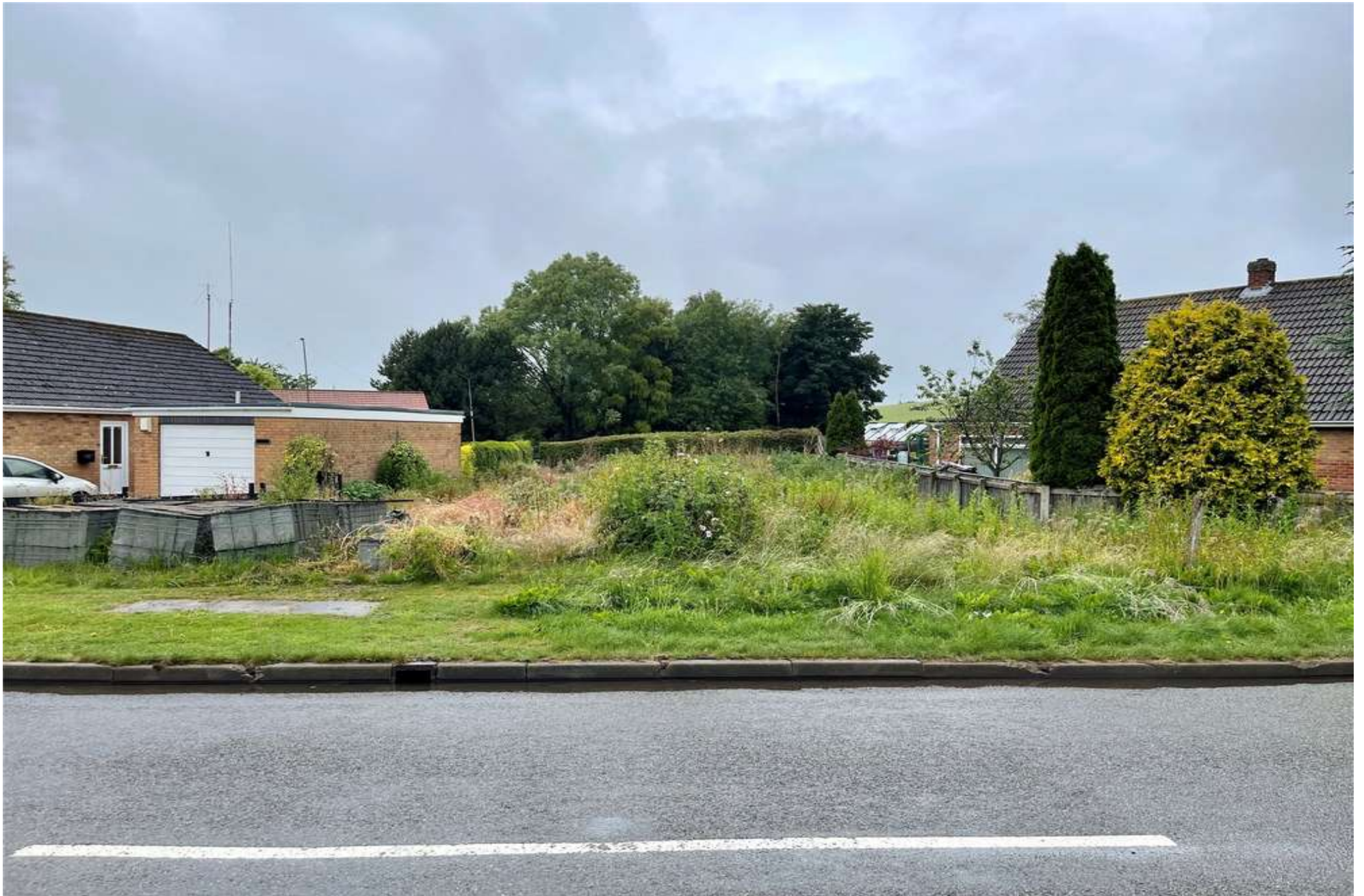
Plot Of Land, Backing Onto Bowling Green, Grimsby Road, Binbrook, Lincolnshire, LN8 6DH