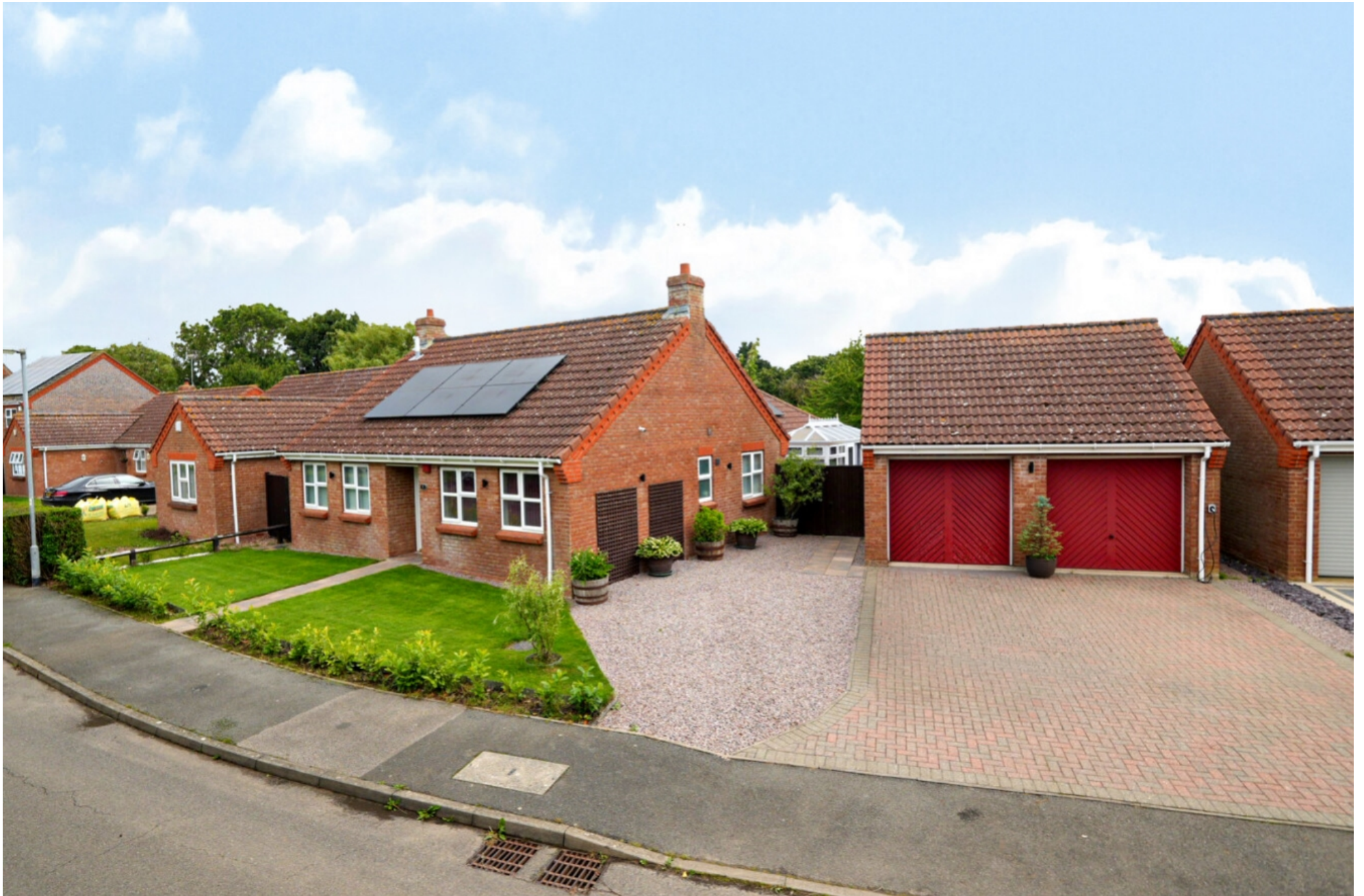
4 Strawberry Fields Drive , Holbeach St. Marks, Spalding, Lincolnshire, PE12 8ER