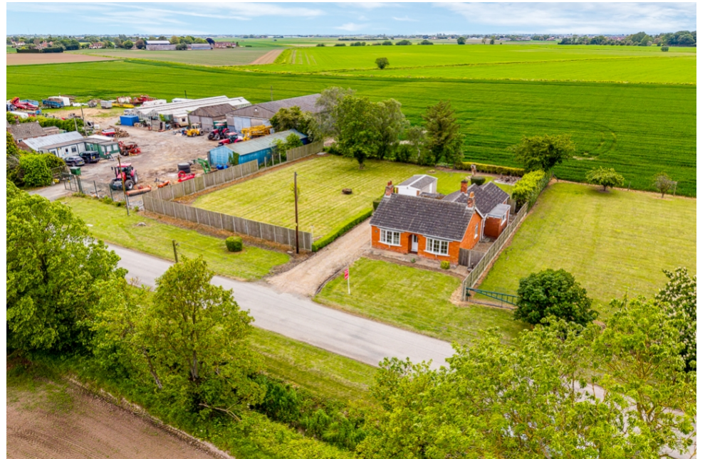
The Bungalow, Fenhouses Lane, Swineshead, Boston, Lincolnshire, PE20 3HE