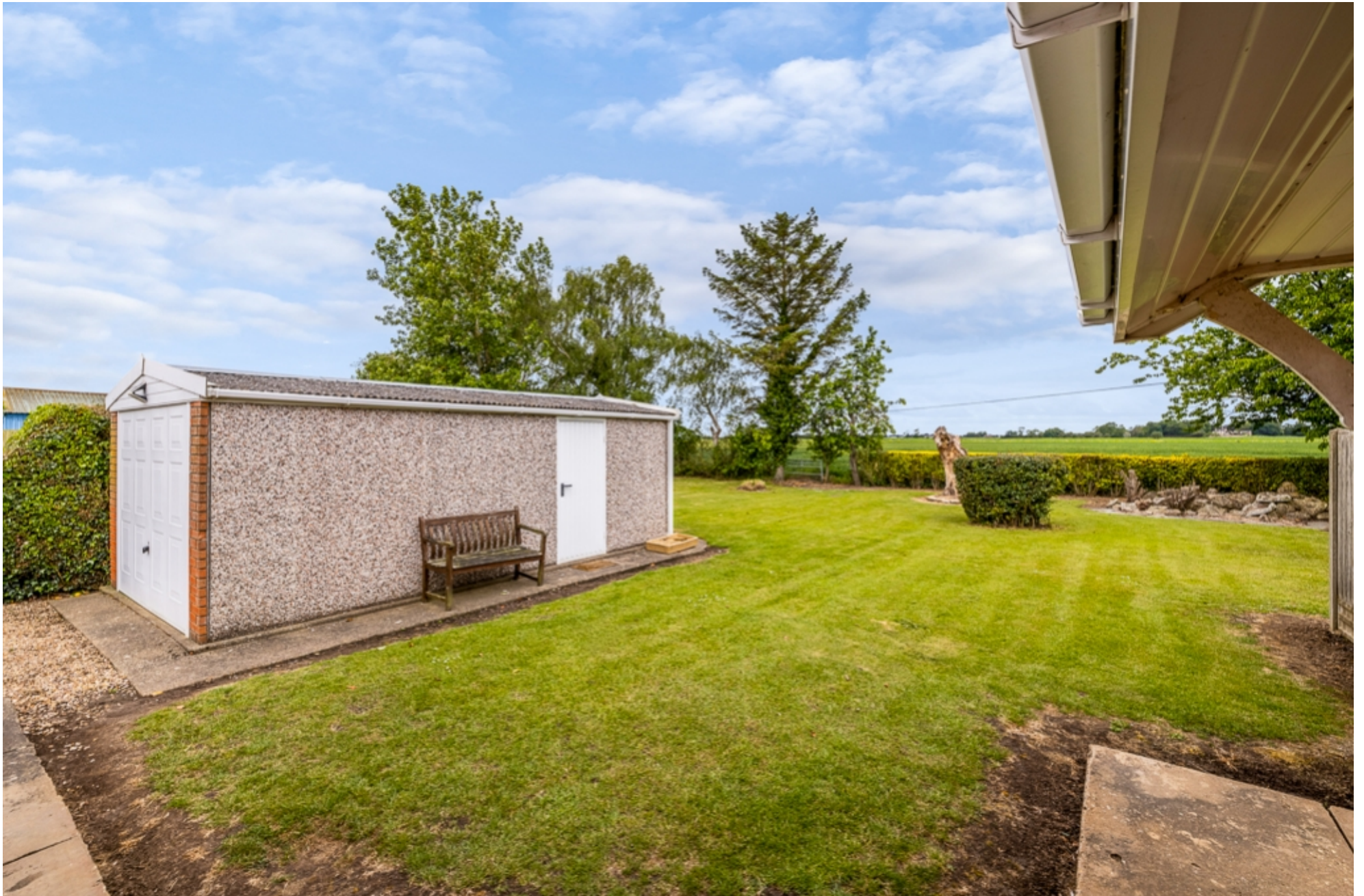
The Bungalow, Fenhouses Lane, Swineshead, Boston, Lincolnshire, PE20 3HE