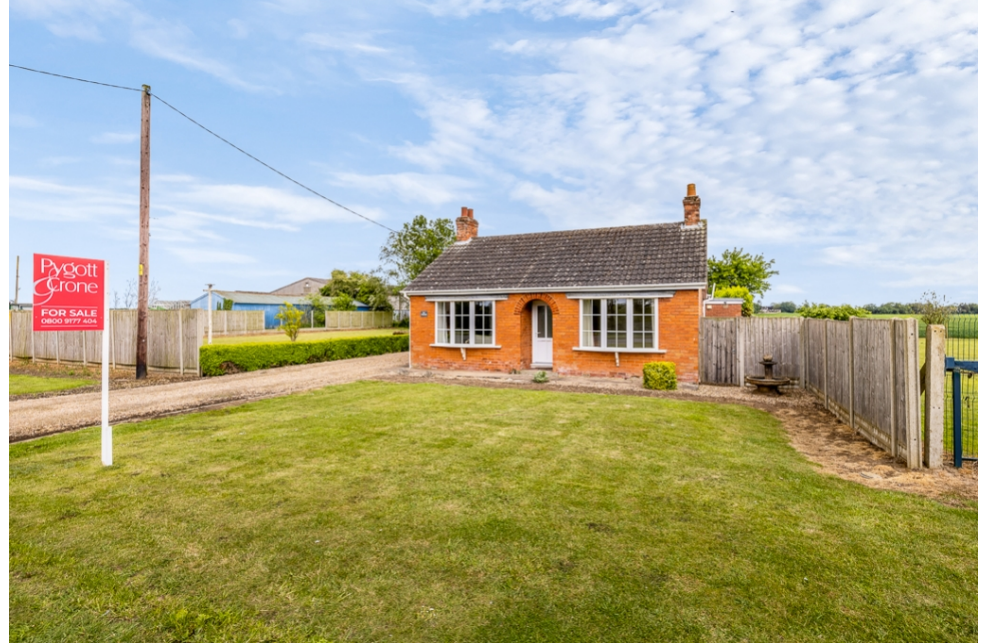
The Bungalow, Fenhouses Lane, Swineshead, Boston, Lincolnshire, PE20 3HE