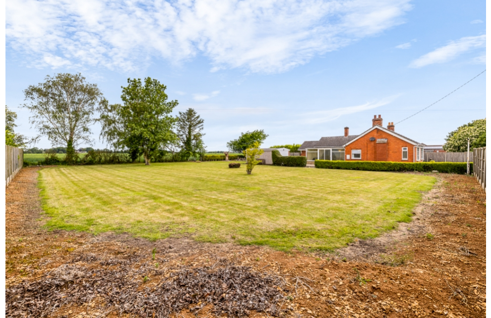
The Bungalow, Fenhouses Lane, Swineshead, Boston, Lincolnshire, PE20 3HE