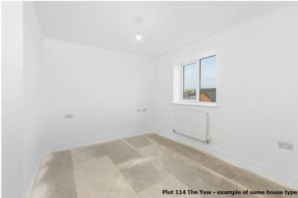
Plot 114 The Yew - example of same house type