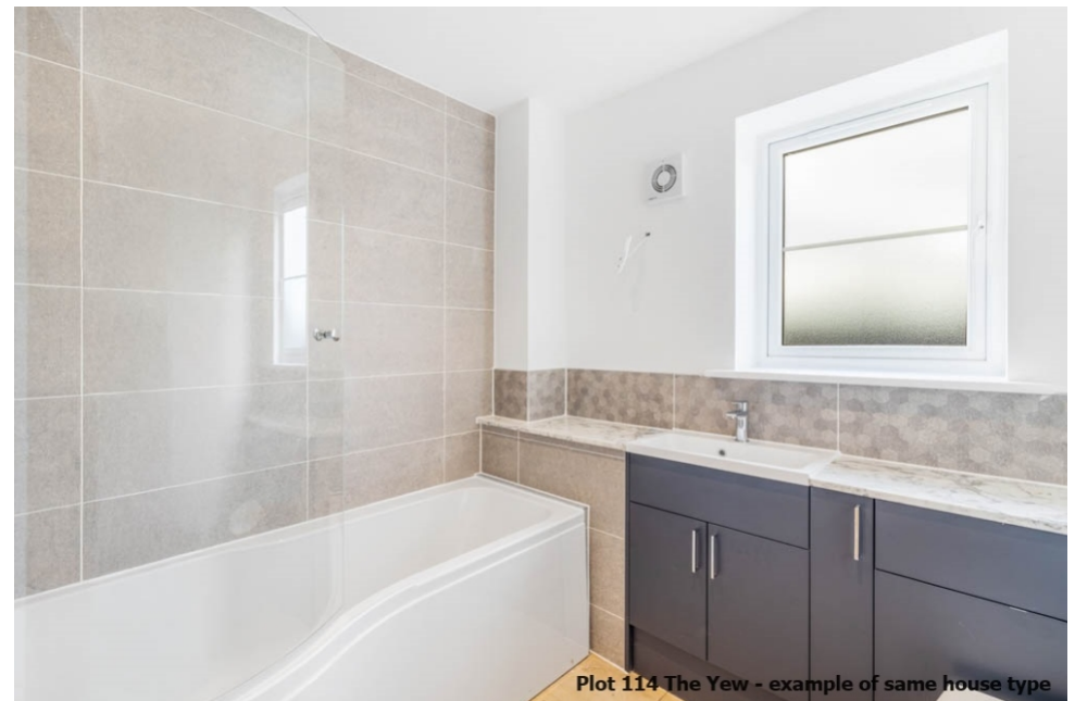
Plot 114 The Yew - example of same house type