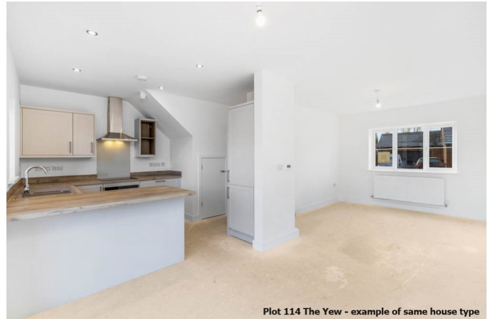
Plot 114 The Yew - example of same house type

Please note: A management company charge of £125 per annum applies. Specifications are subject to change. Floorplans and measurements are taken from architectural drawings and are provided for guidance purposes only. Individual properties may vary from the information shown here. All sizes are approximate and should not be used to measure for furnishings. Please refer to the site map for plot numbers for the house type. The dimensions are taken from the architect's plans and should not be used as a basis for the purchase of furnishings. Individual properties may vary from illustrations shown. This information is for guidance only and does not form part of a contract. There is a site management company, and charge per year. Talk to us about costs. Internal images shown within this advert of from a Alder design home completed on another site to be used as an example. These images also show added extras and some fittings that may not be included as standard.