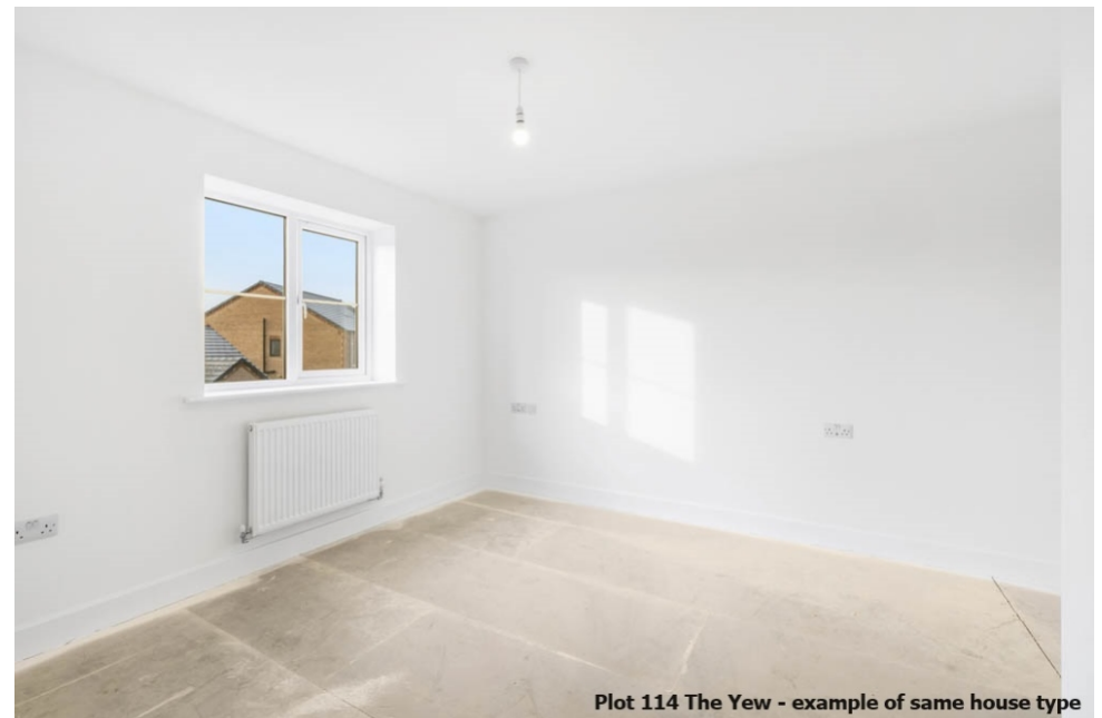
Plot 114 The Yew - example of same house type