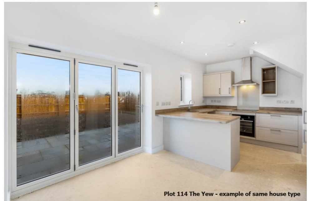
Plot 114 The Yew - example of same house type