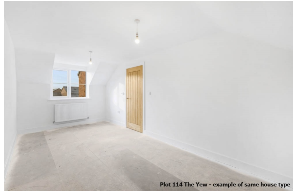
Plot 114 The Yew - example of same house type

A collection of brand-new, high-specification homes offering a variety of designs and architectural styles to suit a wide range of buyers. A show home is available to view. Brunswick Fields is an exclusive new residential development located on the edge of the historic Fenland market town of Long Sutton. The development will offer a stylish selection of homes set on generous plots, thoughtfully designed to appeal to a range of buyers and budgets. Each property will be finished to a high specification, with careful attention to detail and the use of quality materials, fixtures, and fittings throughout. Depending on the stage of construction, purchasers may have the opportunity to personalise certain finishes.