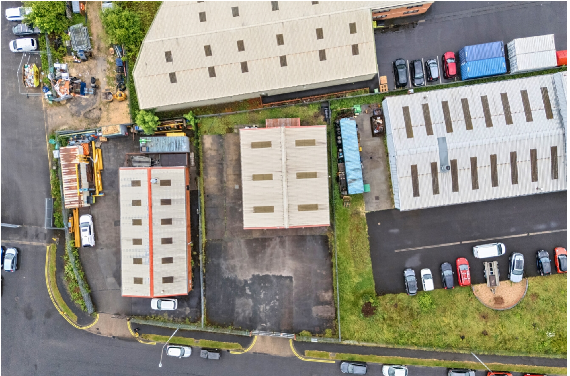
Star Coaches, Sandars Road, Heapham Road Industrial Estate, Gainsborough, Lincolnshire, DN21 1RZ