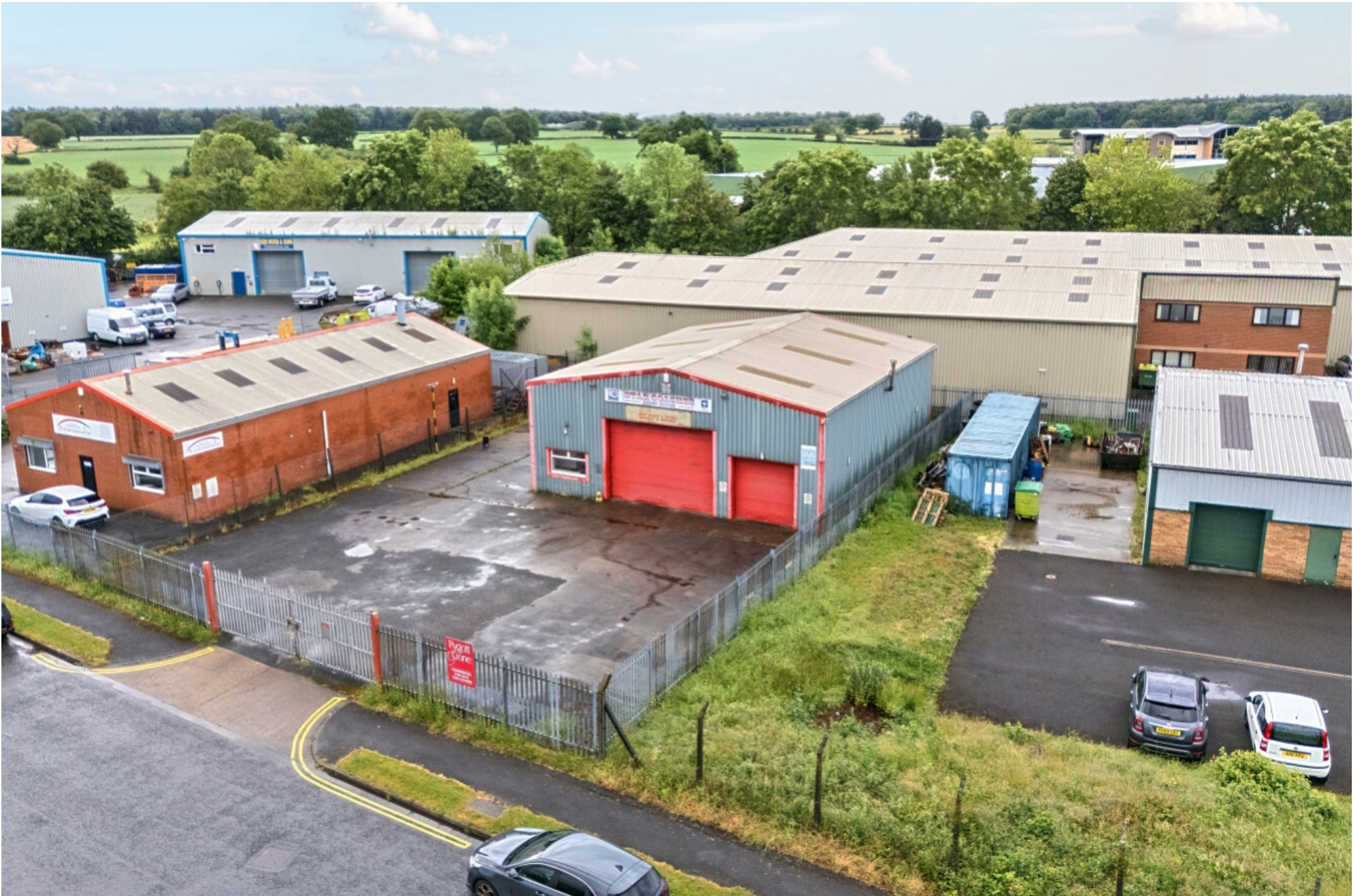
Star Coaches, Sandars Road, Heapham Road Industrial Estate, Gainsborough, Lincolnshire, DN21 1RZ