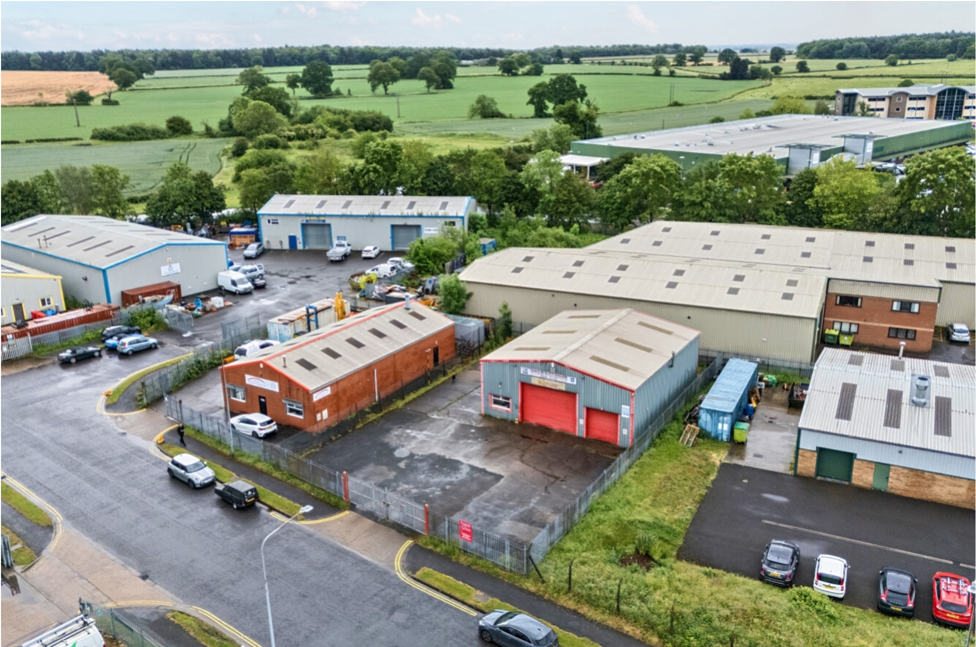
Star Coaches, Sandars Road, Heapham Road Industrial Estate, Gainsborough, Lincolnshire, DN21 1RZ