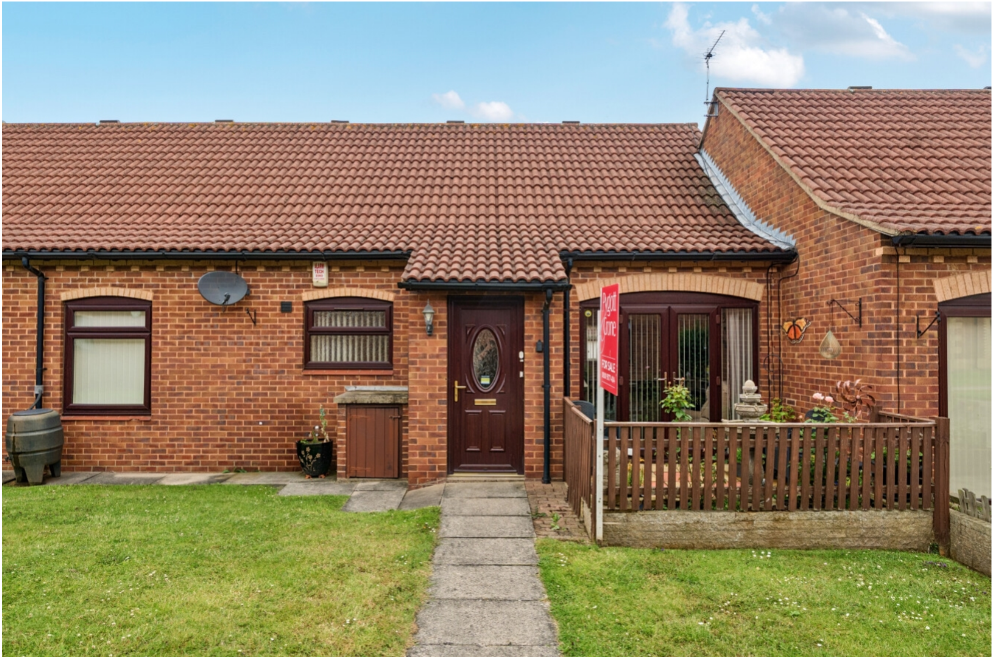
2 Queens Court, Grimsby, Lincolnshire, DN34 5TT