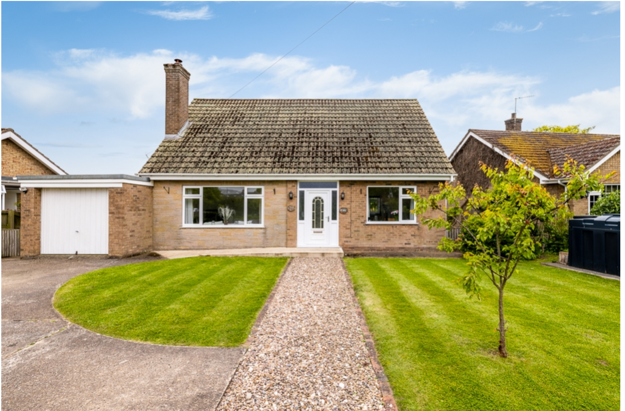
44 School Lane, Old Leake, Boston, Lincolnshire, PE22 9NJ