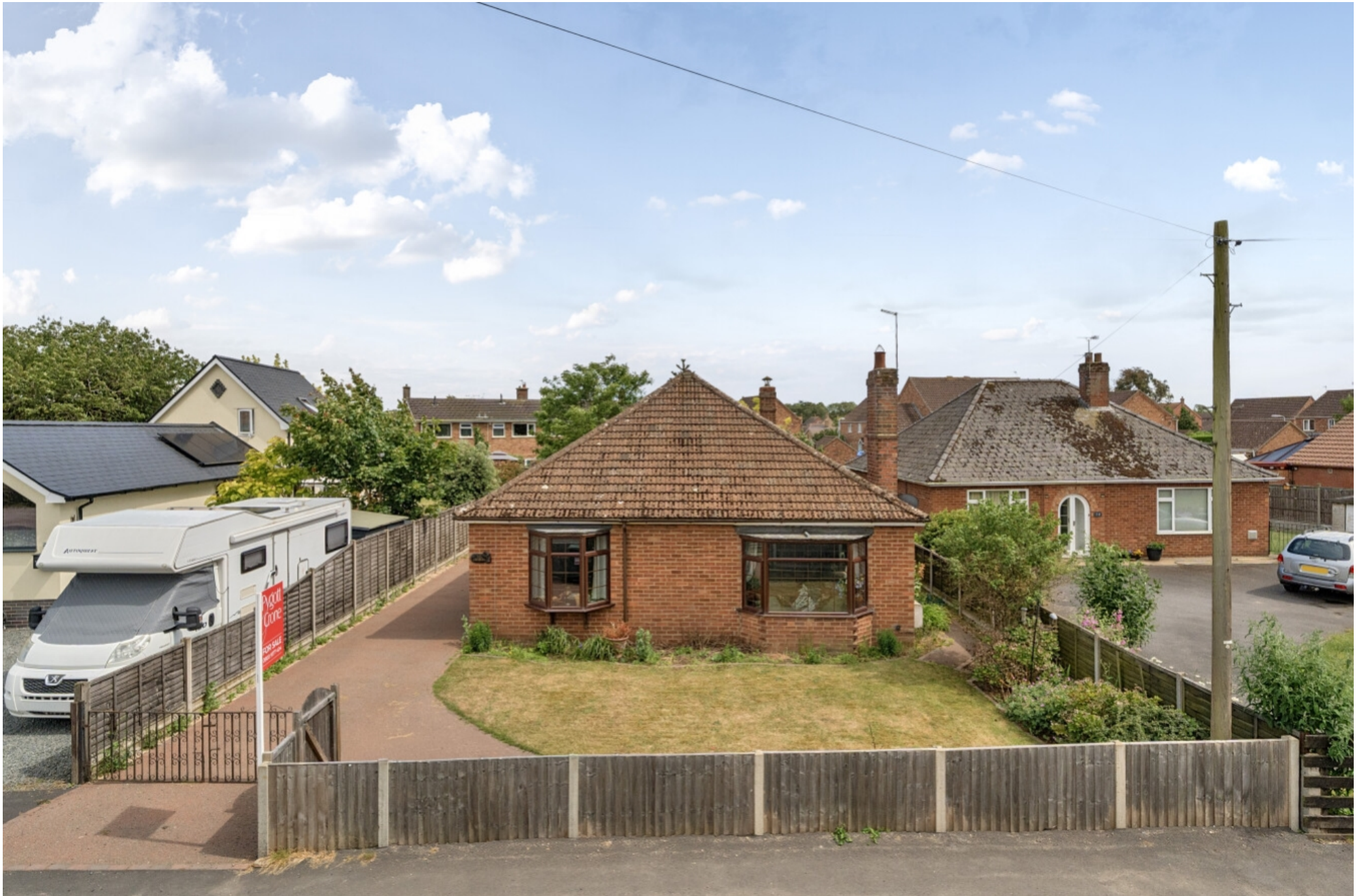
37 Dogdyke Road, Coningsby, Lincoln, Lincolnshire, LN4 4TB