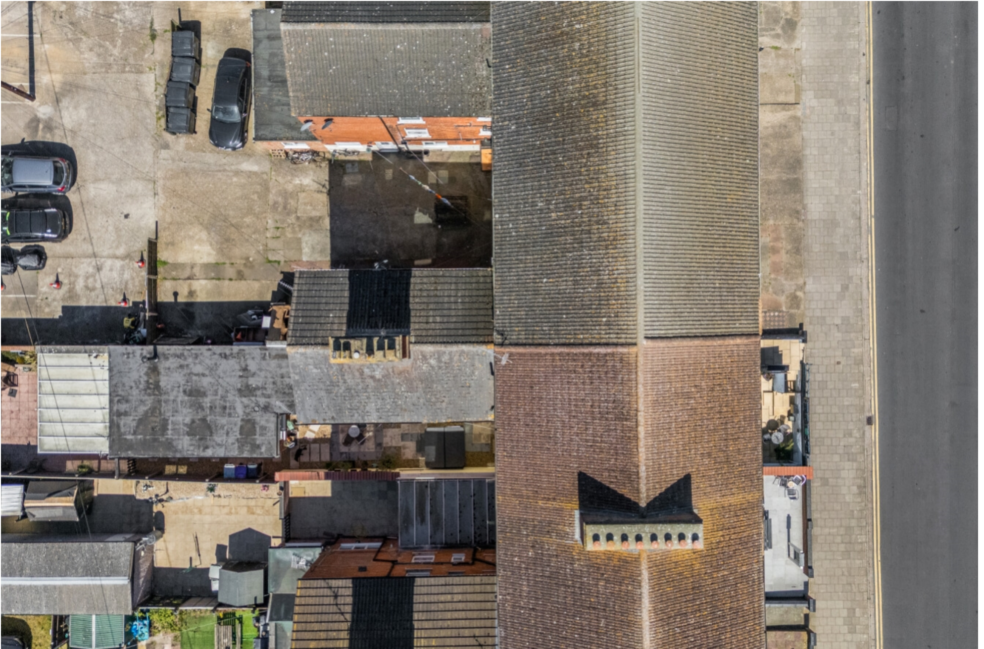
The Laurels Hotel, 50 South Parade, Skegness, Lincolnshire, PE25 3HW