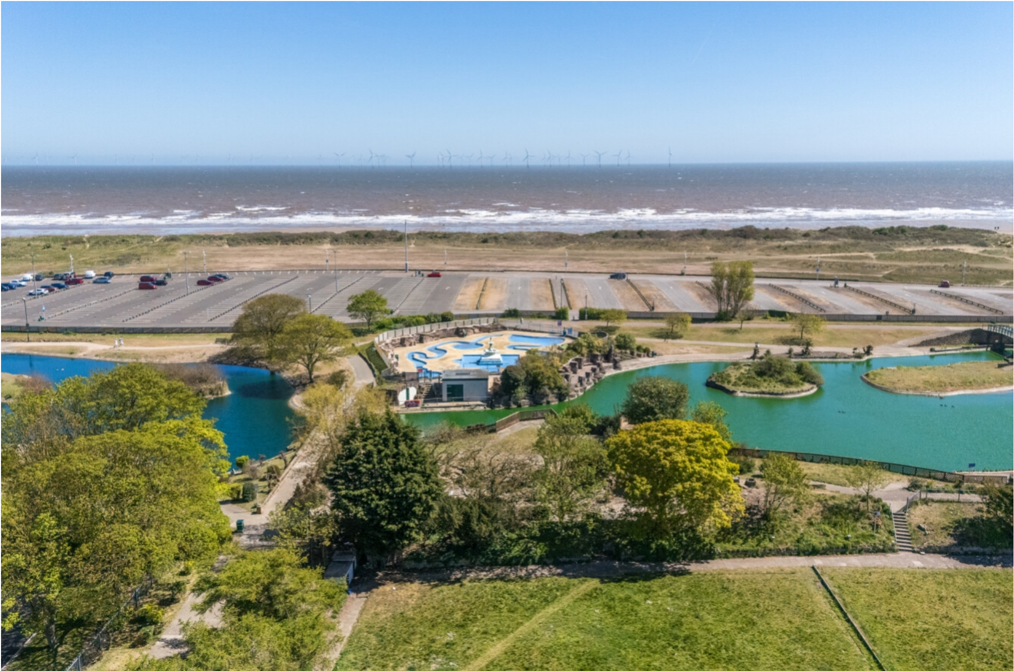
The Laurels Hotel, 50 South Parade, Skegness, Lincolnshire, PE25 3HW