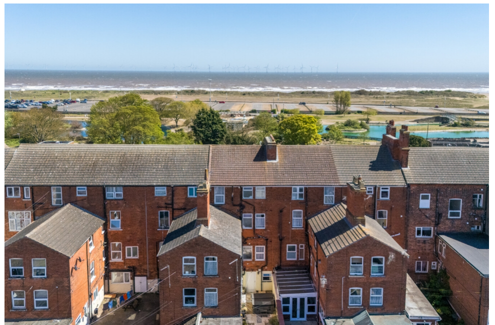
The Laurels Hotel, 50 South Parade, Skegness, Lincolnshire, PE25 3HW