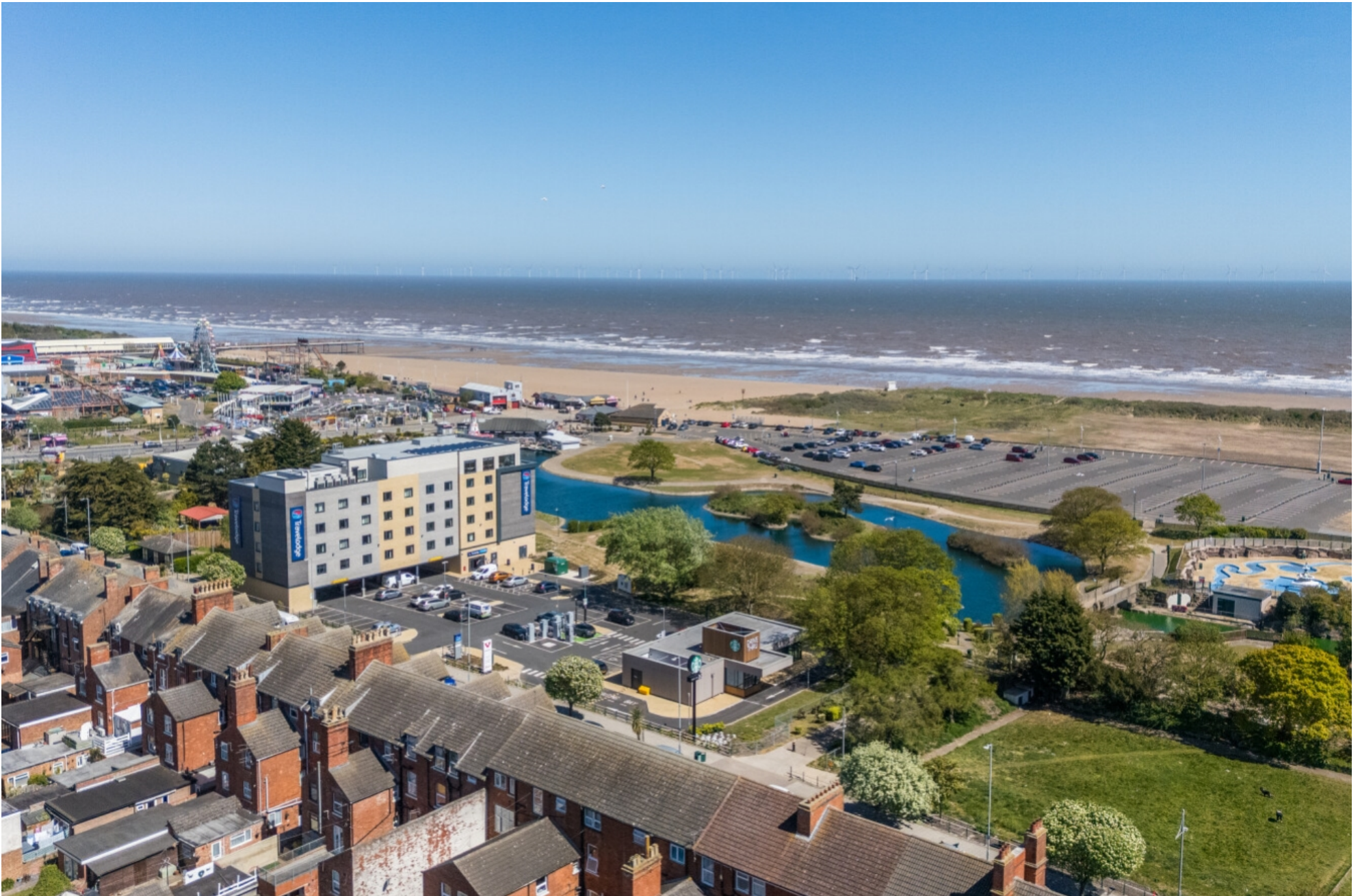
The Laurels Hotel, 50 South Parade, Skegness, Lincolnshire, PE25 3HW