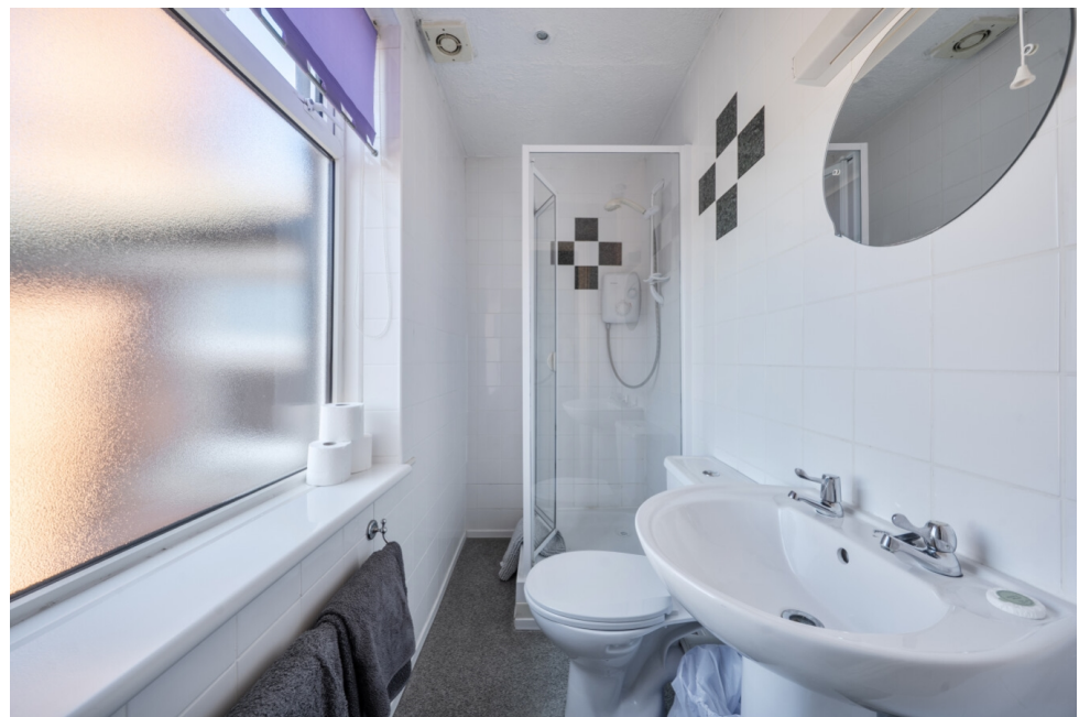
The Laurels Hotel, 50 South Parade, Skegness, Lincolnshire, PE25 3HW