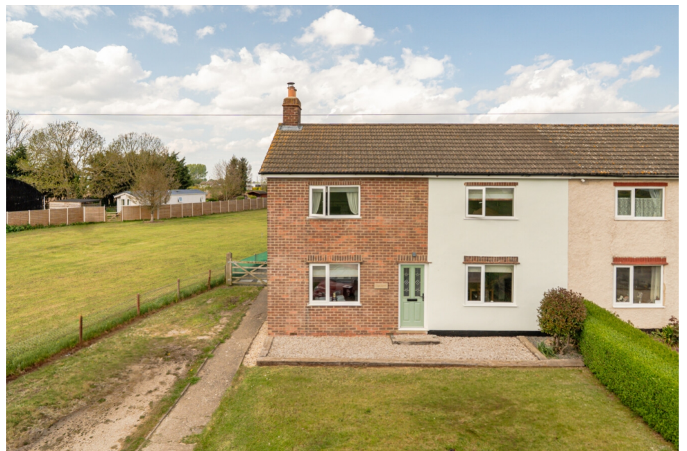
Fencroft, Sarah Gate Lane, Quadring, Spalding, Lincolnshire, PE11 4QE