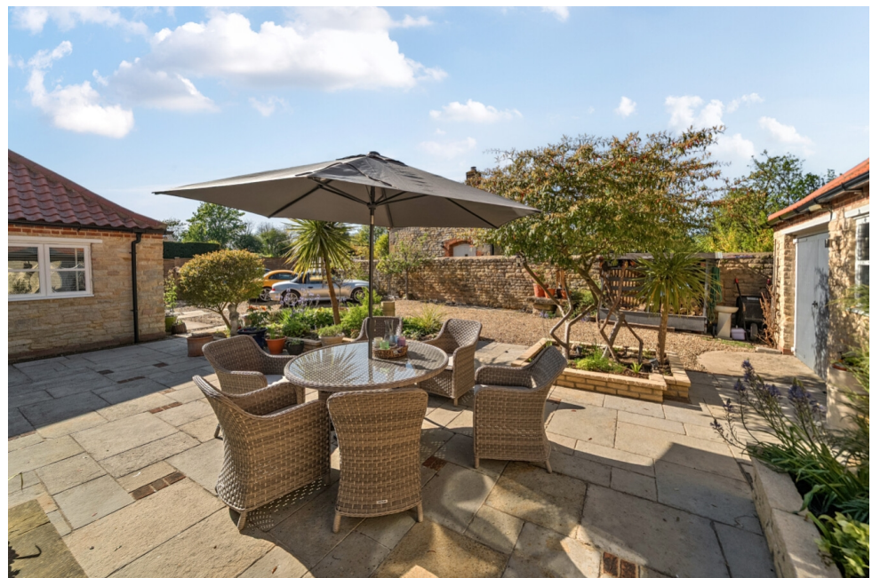
Church Barn, Aunsby, Sleaford, Lincolnshire, NG34 8TA