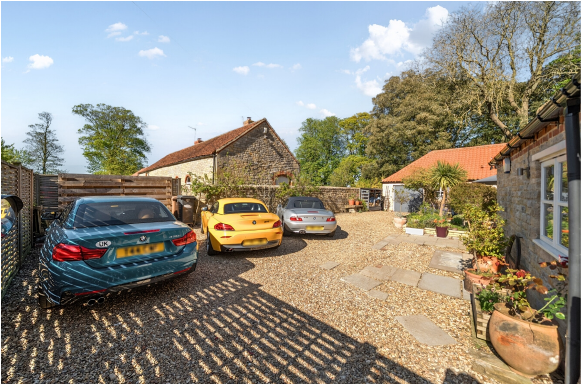
Church Barn, Aunsby, Sleaford, Lincolnshire, NG34 8TA