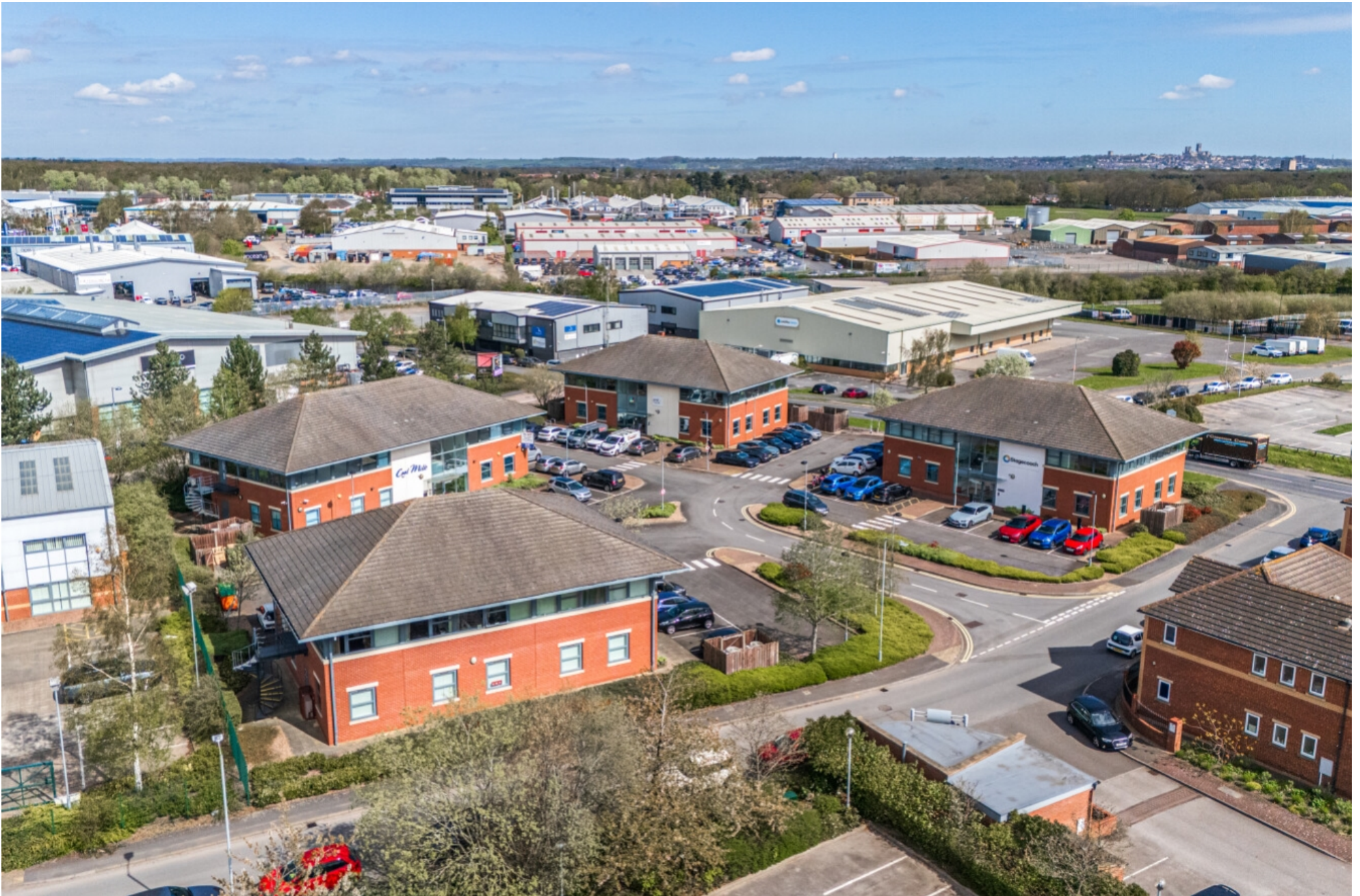
Building 1, Kingsley Office Park, Runcorn Road, Lincoln, Lincolnshire, LN6 3TA