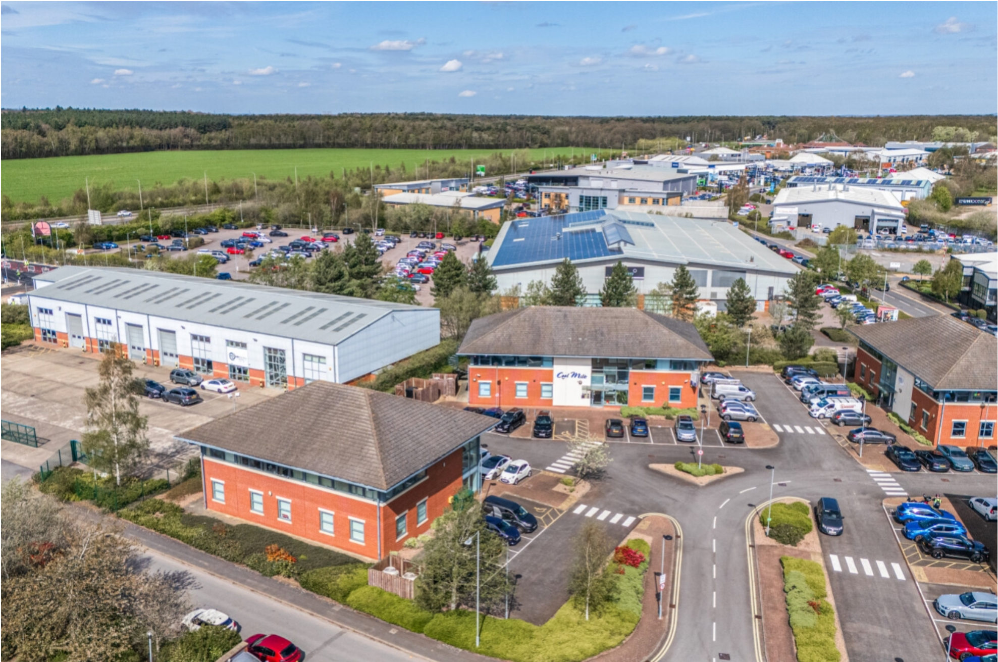
Building 1, Kingsley Office Park, Runcorn Road, Lincoln, Lincolnshire, LN6 3TA