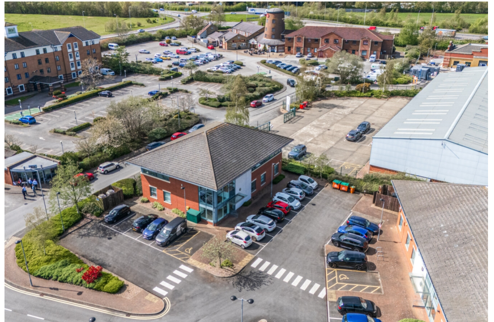
Building 1, Kingsley Office Park, Runcorn Road, Lincoln, Lincolnshire, LN6 3TA