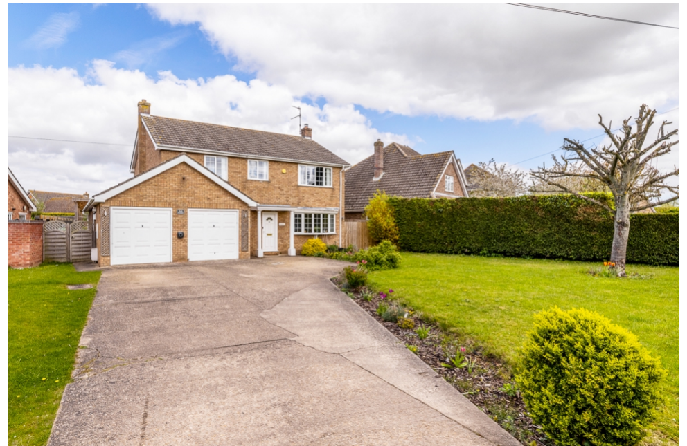
York House, Clamp Gate Road, Fishtoft, Boston, Lincolnshire, PE21 0RY