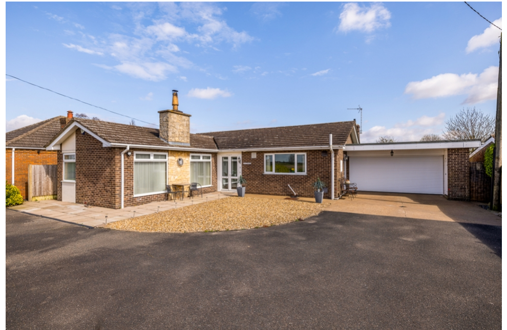
Culsharg, 1 Leagate Road, Antons Gowt, Boston, Lincolnshire, PE22 7BN