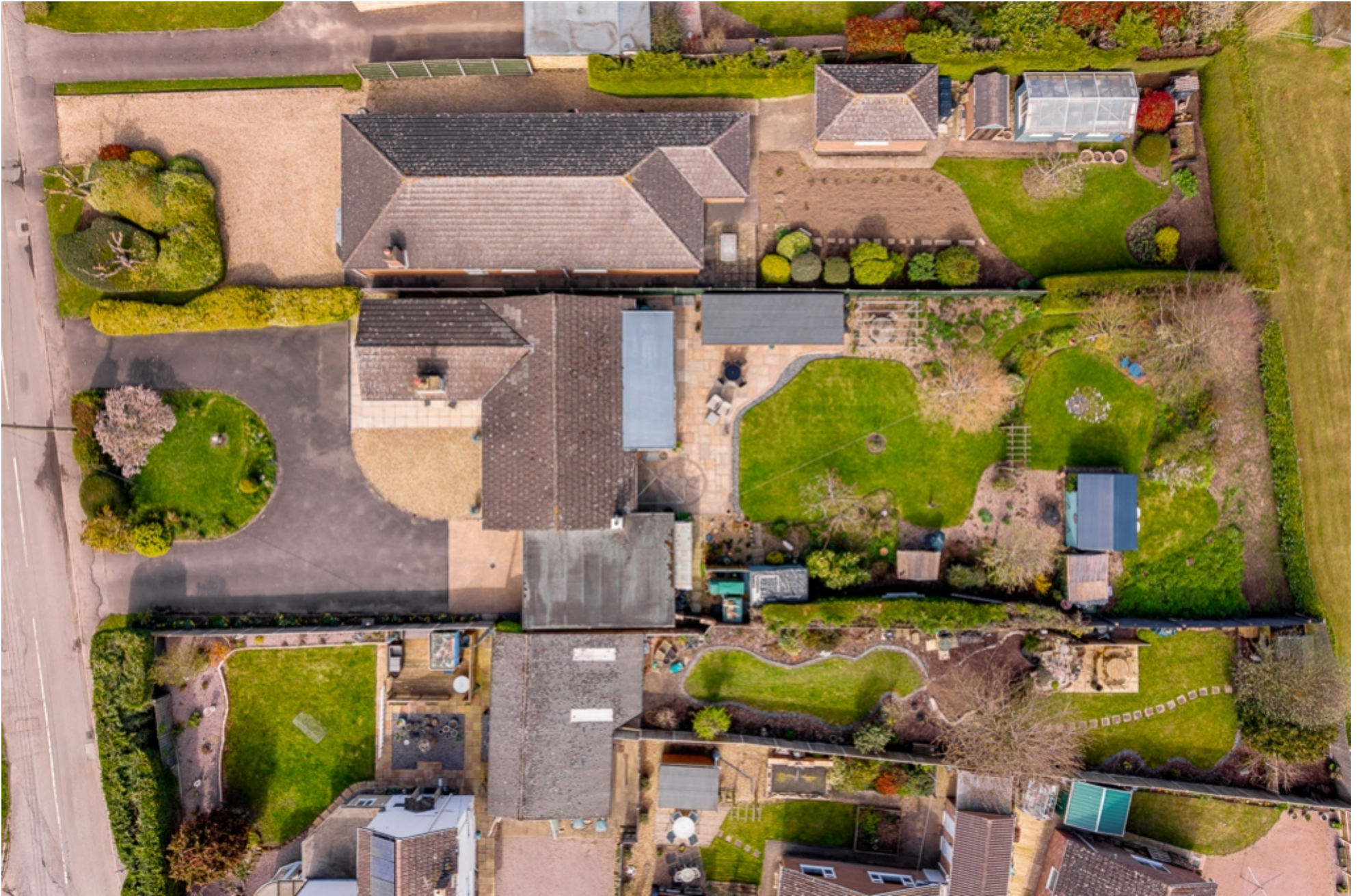
Culsharg, 1 Leagate Road, Antons Gowt, Boston, Lincolnshire, PE22 7BN