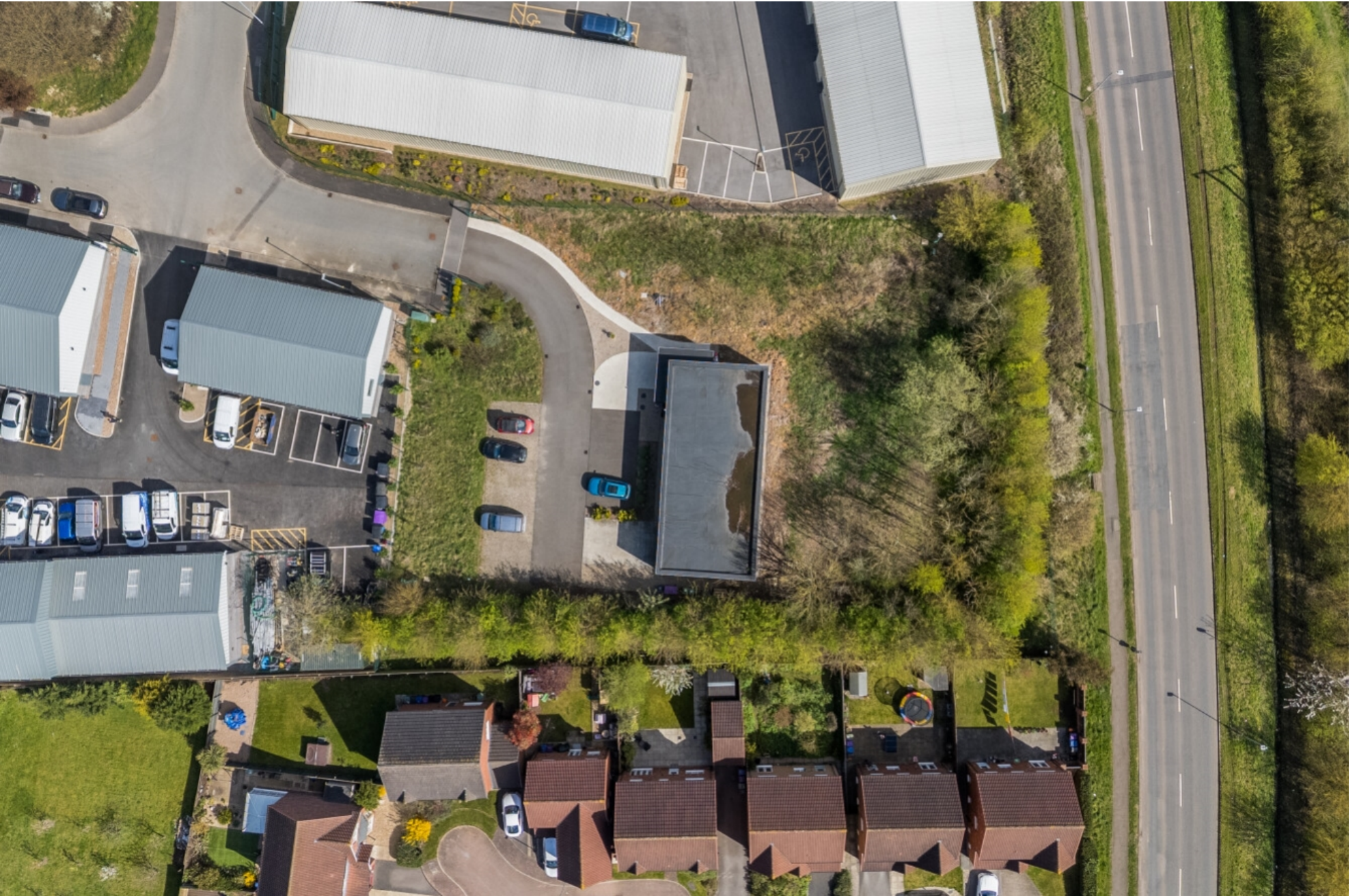
Vulcan Bossit House, Wharton Close, Gainsborough, Lincolnshire, DN21 1EB