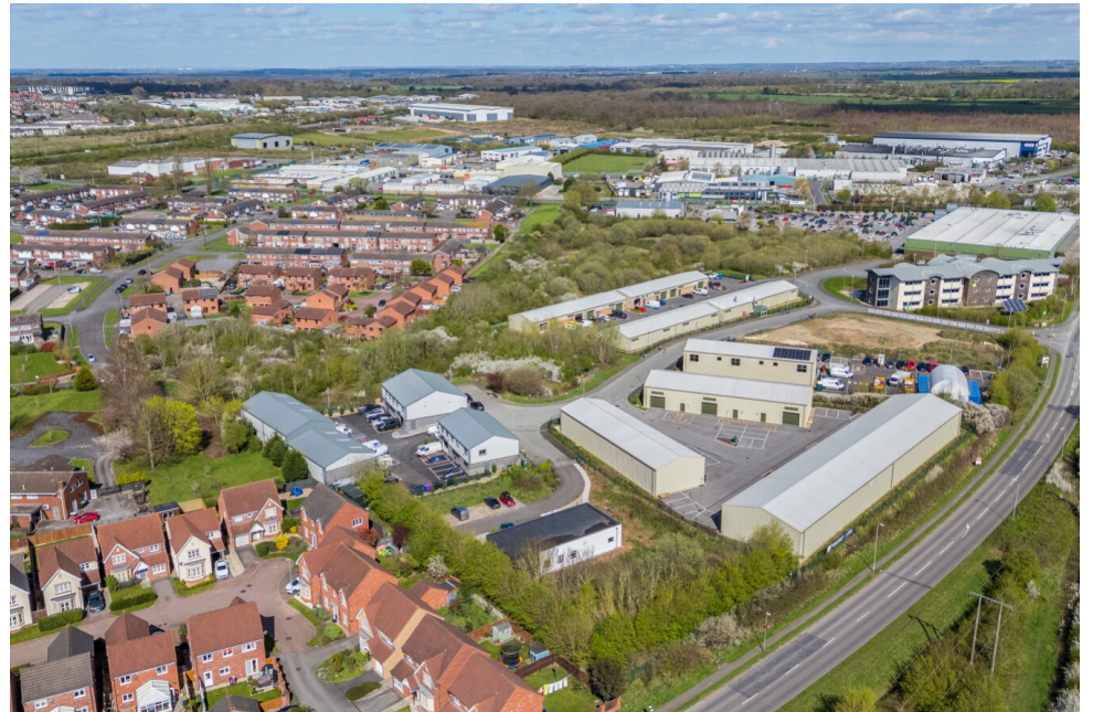
Vulcan Bossit House, Wharton Close, Gainsborough, Lincolnshire, DN21 1EB