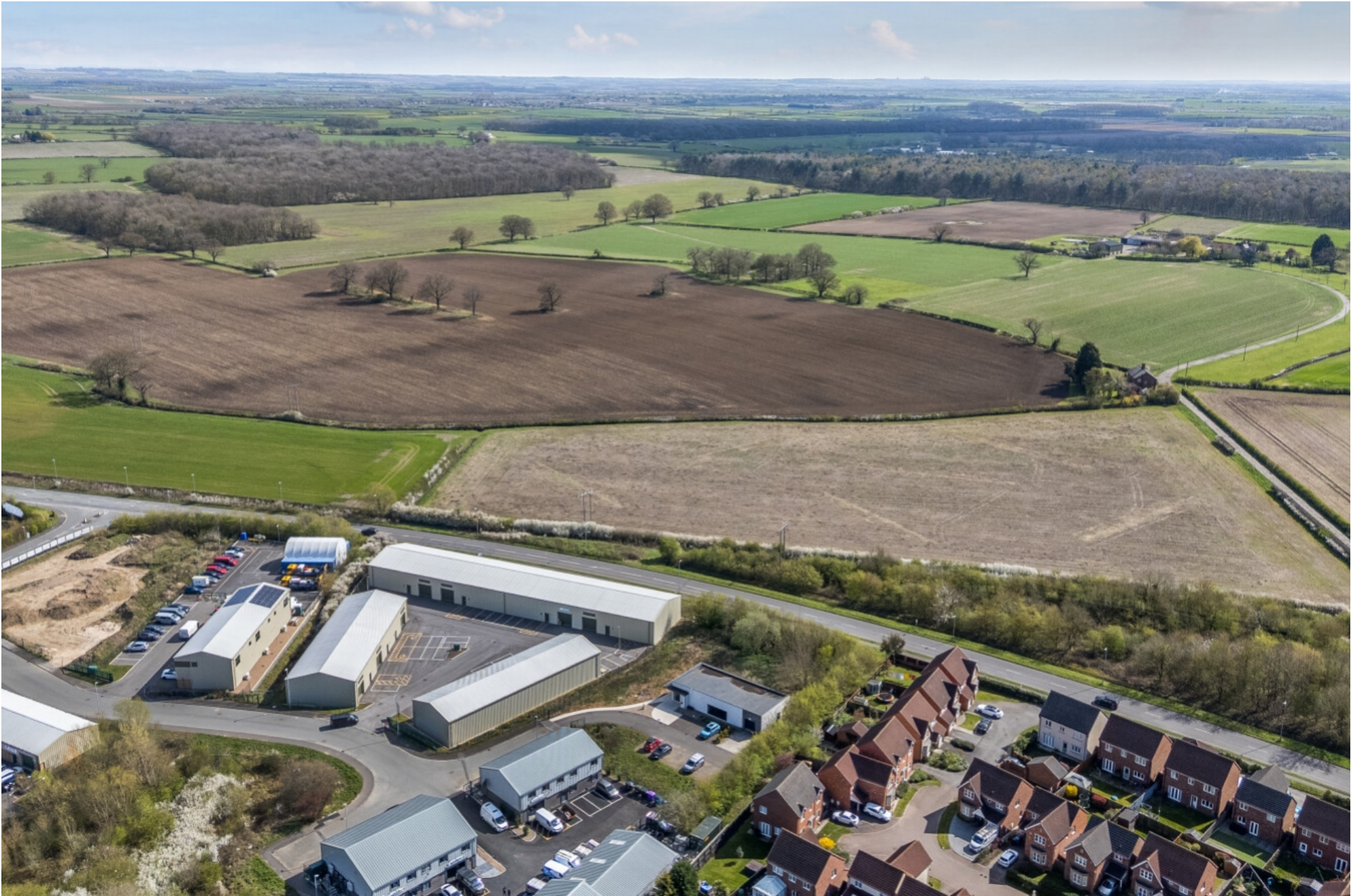
Vulcan Bossit House, Wharton Close, Gainsborough, Lincolnshire, DN21 1EB