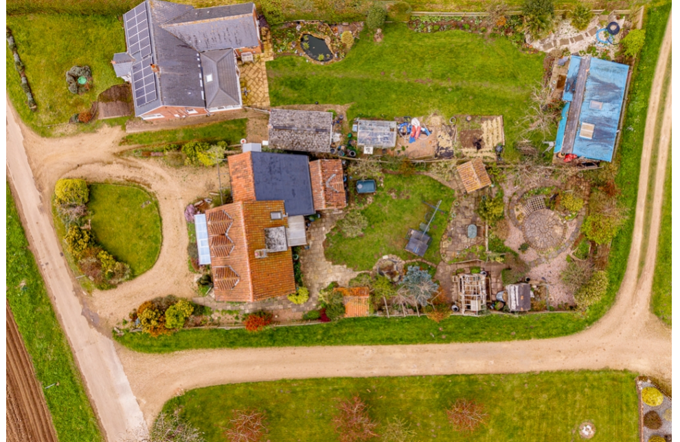
Railway Cottage, Fieldside, Mareham-le-Fen, Boston, Lincolnshire, PE22 7RS