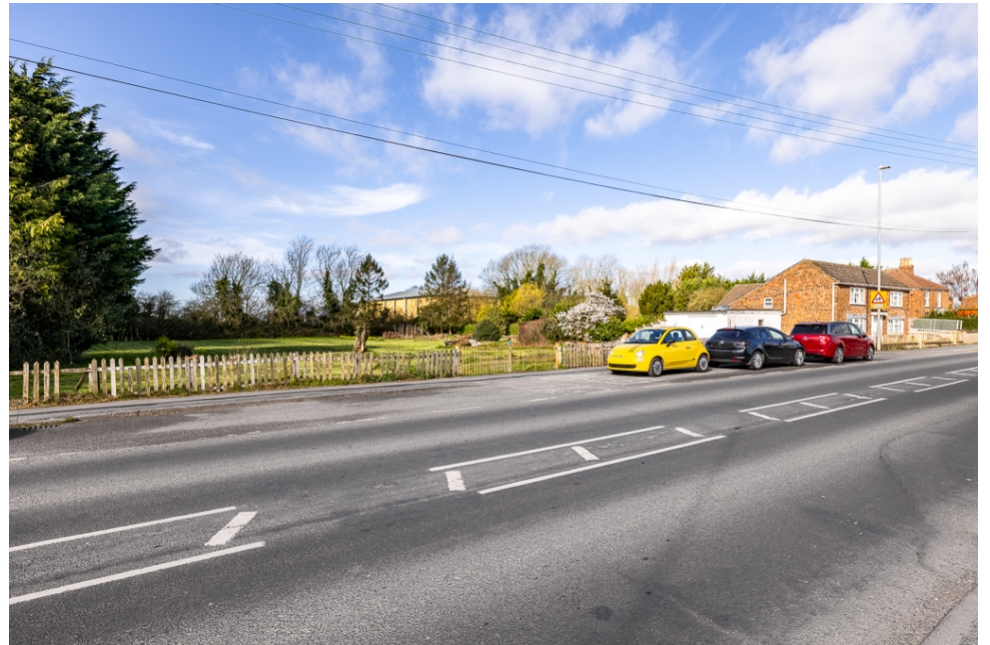
The Forge, Main Road, Stickney, Boston, Lincolnshire, PE22 8AD