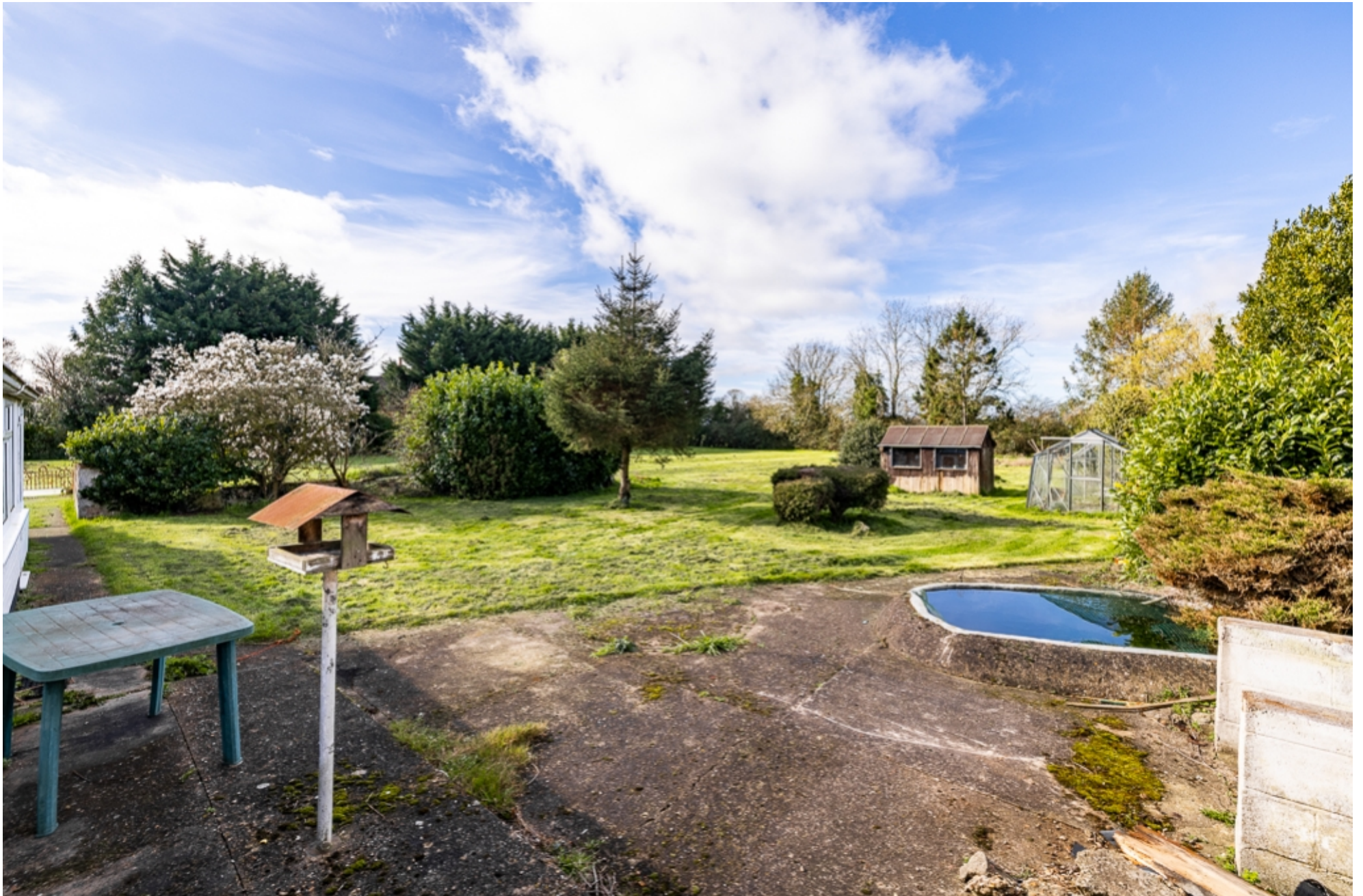
The Forge, Main Road, Stickney, Boston, Lincolnshire, PE22 8AD