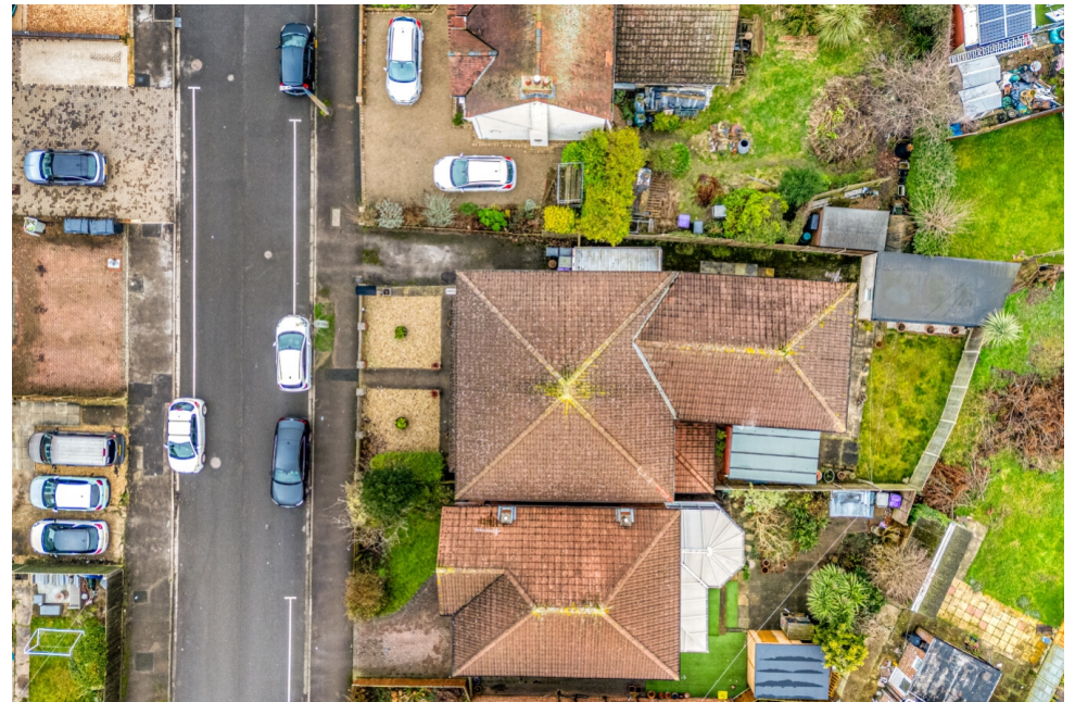
Philmar Guest House, 28 Sunningdale Drive, Skegness, Lincolnshire, PE25 1AZ