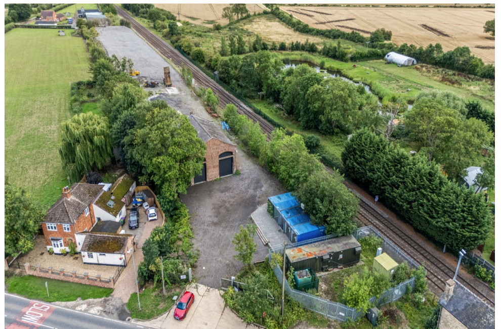
Station Yard , Tillbridge Lane , Stow Park, Lincoln, Lincolnshire, LN1 2AL