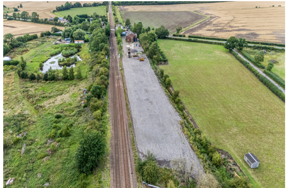
Station Yard , Tillbridge Lane , Stow Park, Lincoln, Lincolnshire, LN1 2AL