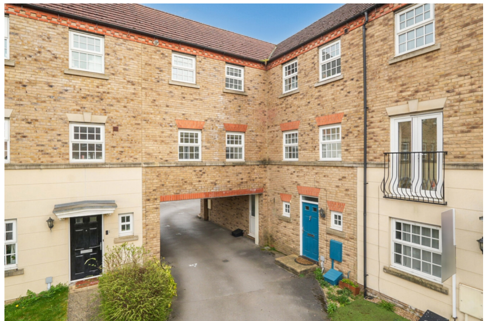
34 Squirrel Chase, Witham St. Hughs, Witham St. Hughs, Lincoln, LN6 9UX