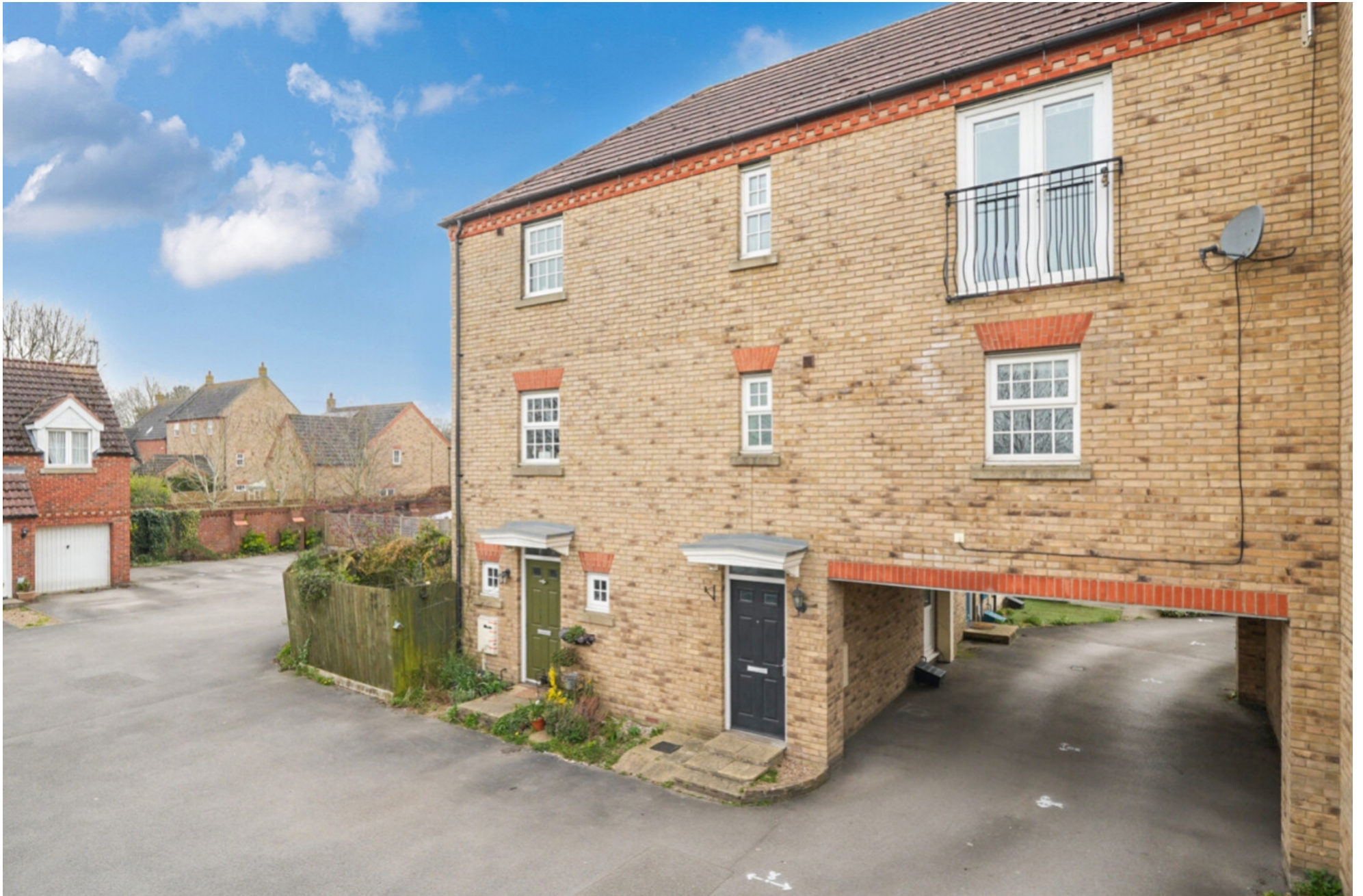
34 Squirrel Chase, Witham St. Hughs, Witham St. Hughs, Lincoln, LN6 9UX