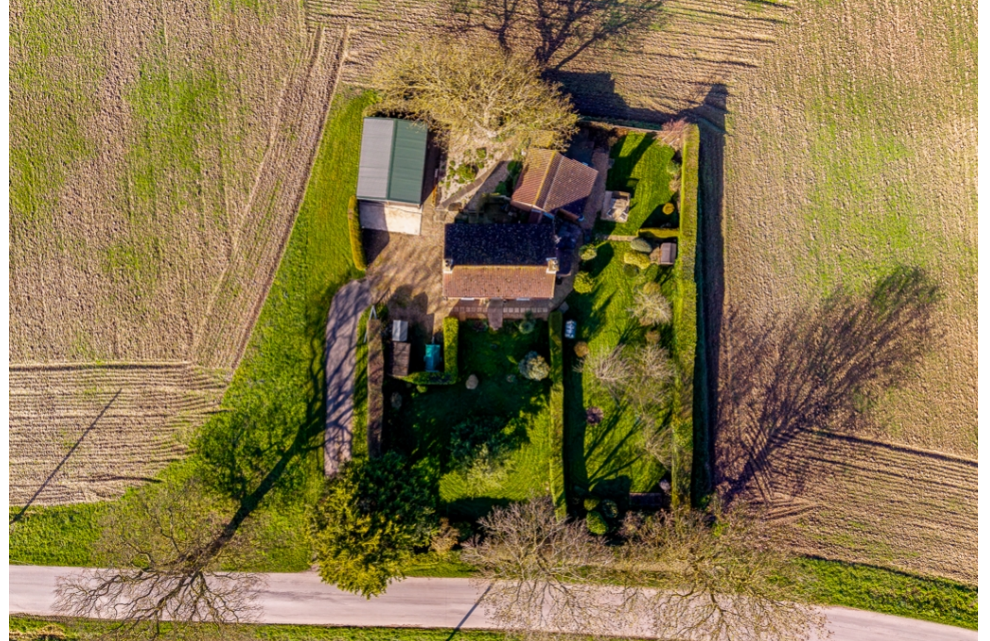
Decoy House, Burgh Road, Friskney, Boston, Lincolnshire, PE22 8NT