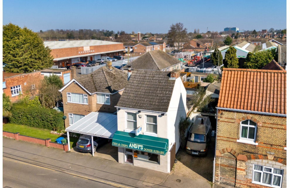
Andys Fish Bar, 14 Tattershall Road, Boston, Lincolnshire, PE21 9JG