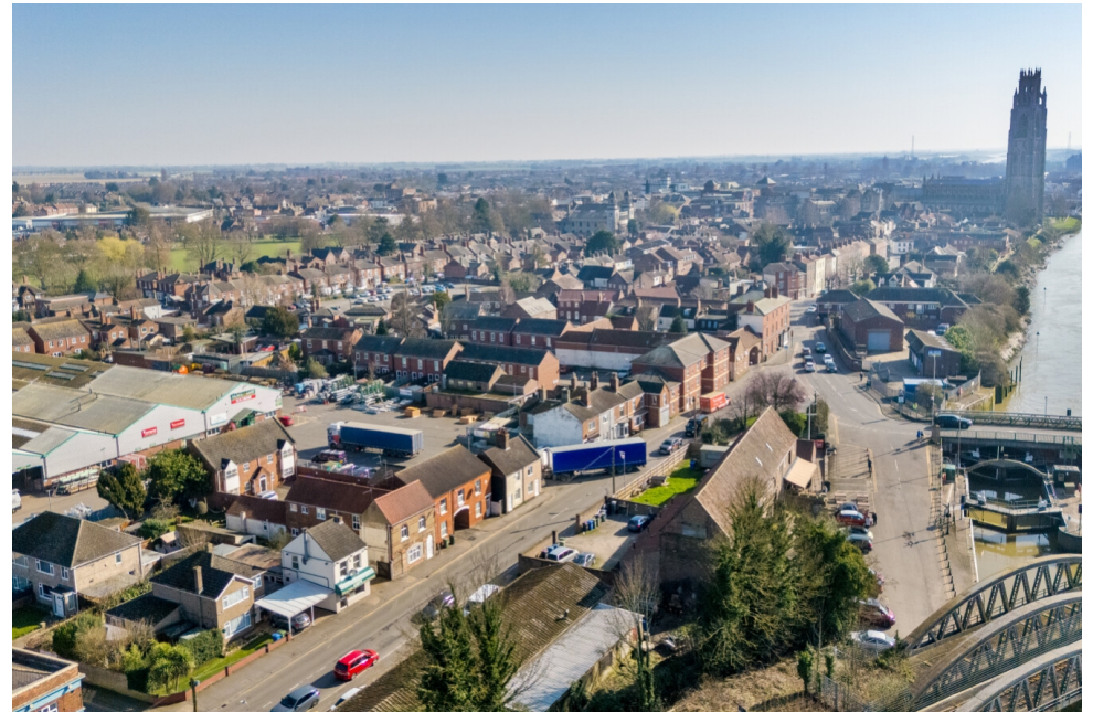
Andys Fish Bar, 14 Tattershall Road, Boston, Lincolnshire, PE21 9JG