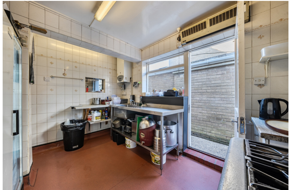
Andy's Fish Bar, 14 Tattershall Road, Boston, Lincolnshire, PE21 9JG