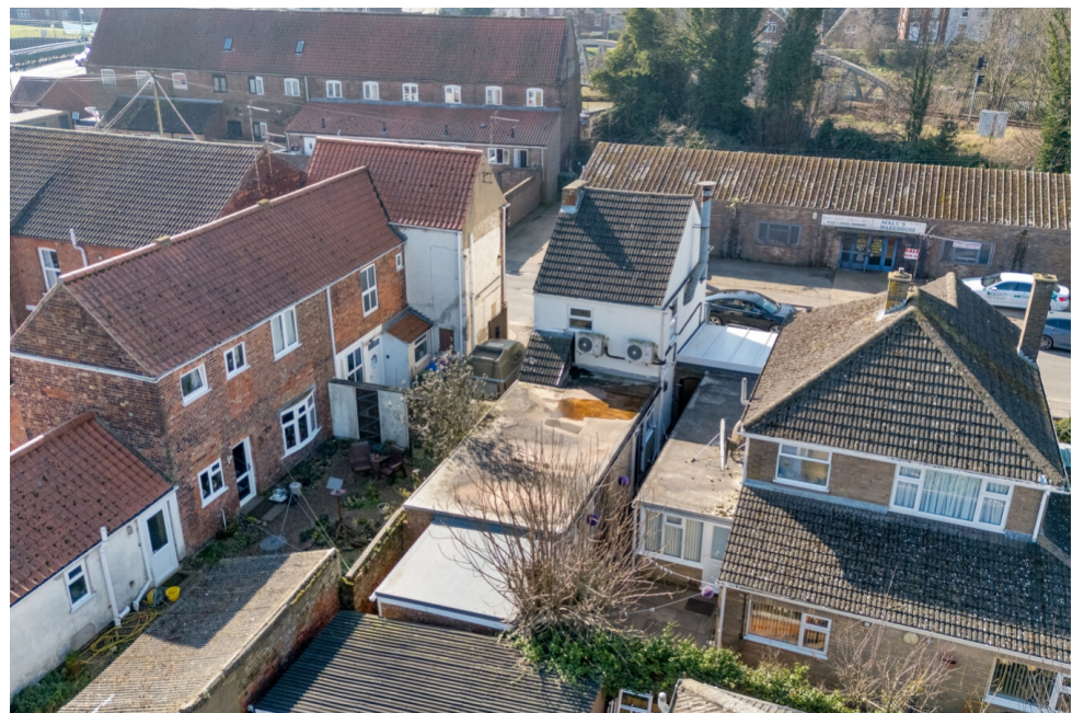
Andys Fish Bar, 14 Tattershall Road, Boston, Lincolnshire, PE21 9JG