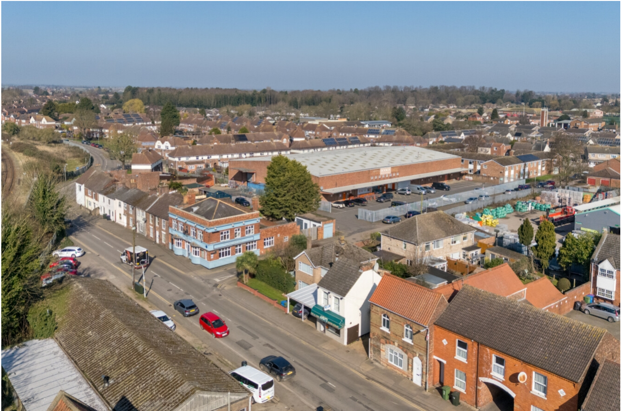
Andys Fish Bar, 14 Tattershall Road, Boston, Lincolnshire, PE21 9JG