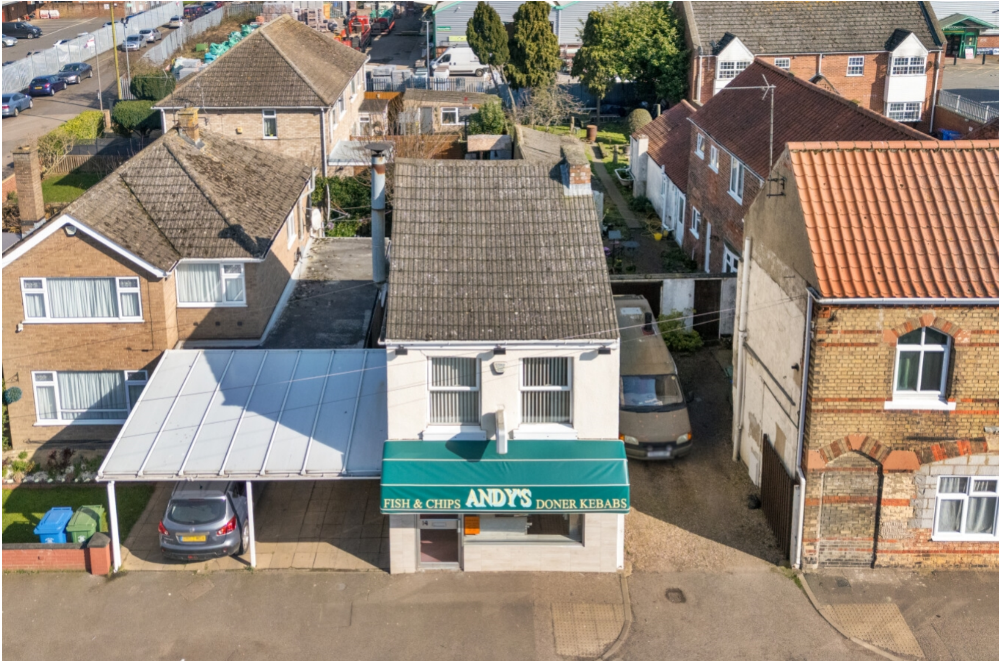
Andy's Fish Bar, 14 Tattershall Road, Boston, Lincolnshire, PE21 9JG