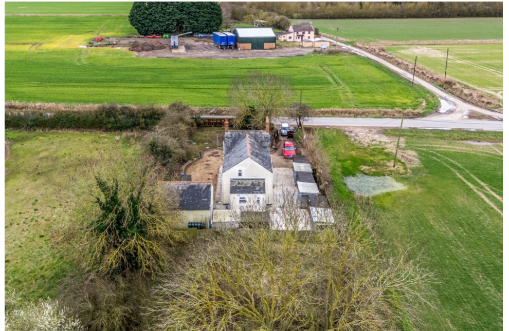
Robbokat, Town Drove, Quadring Fen, Quadring Fen, Spalding, PE11 4QP