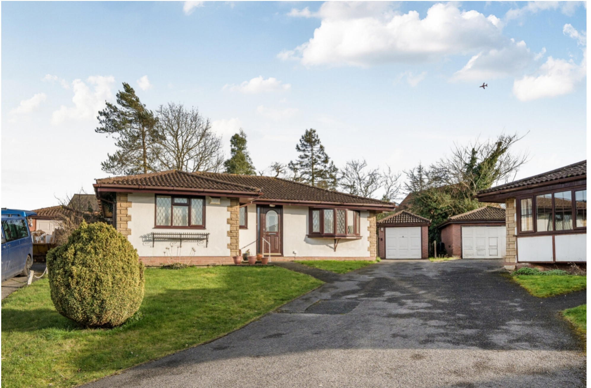
1a, Villa Close, Branston, Lincoln, Lincolnshire, LN4 1LW