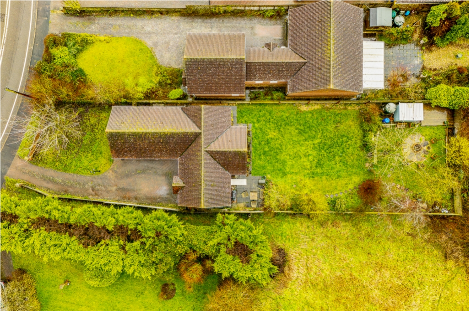
Barlubec, Hagnaby Road, Stickford, Boston, Lincolnshire, PE22 8ET