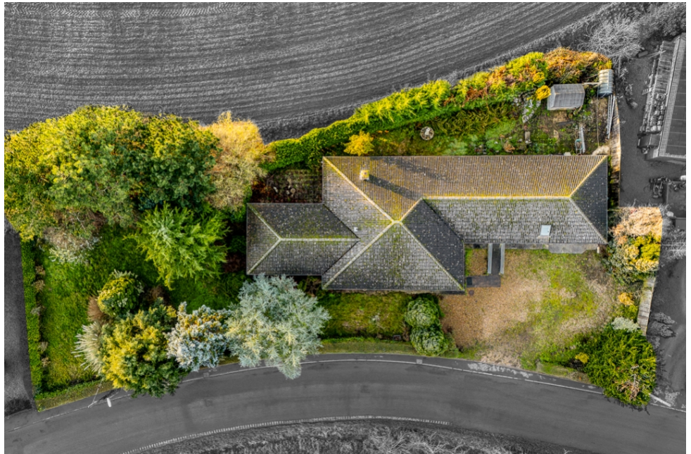
Pisces Villa, Eastgate, Fleet, Holbeach, Spalding, Lincolnshire, PE12 8ND