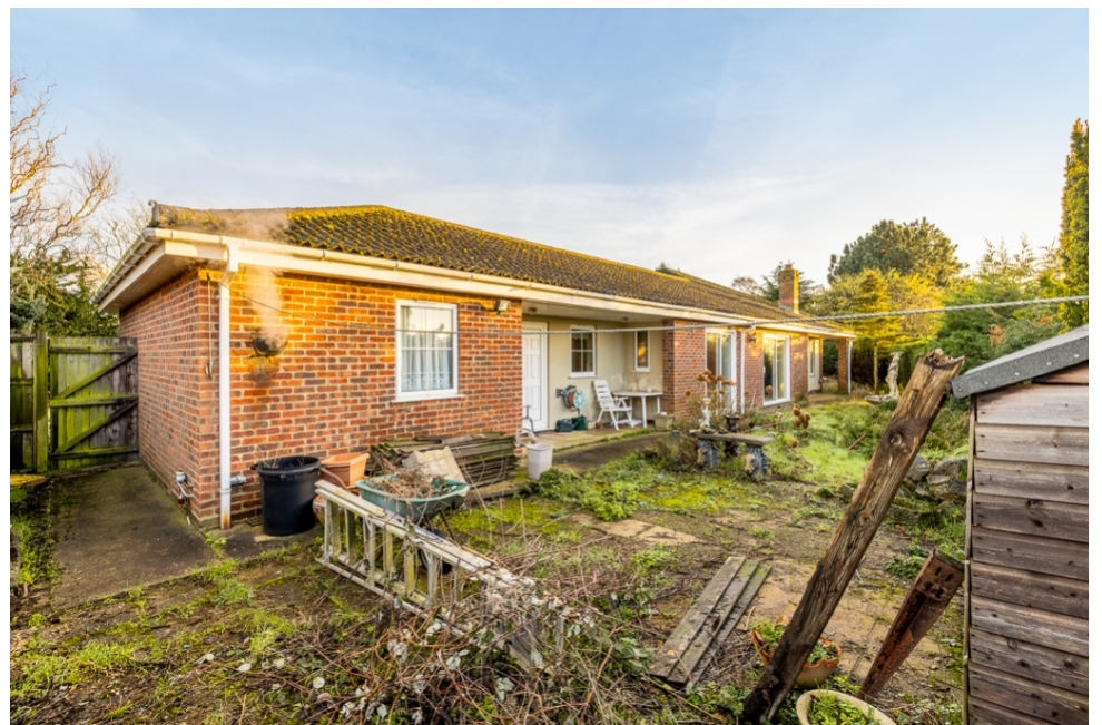
Pisces Villa, Eastgate, Fleet, Holbeach, Spalding, Lincolnshire, PE12 8ND