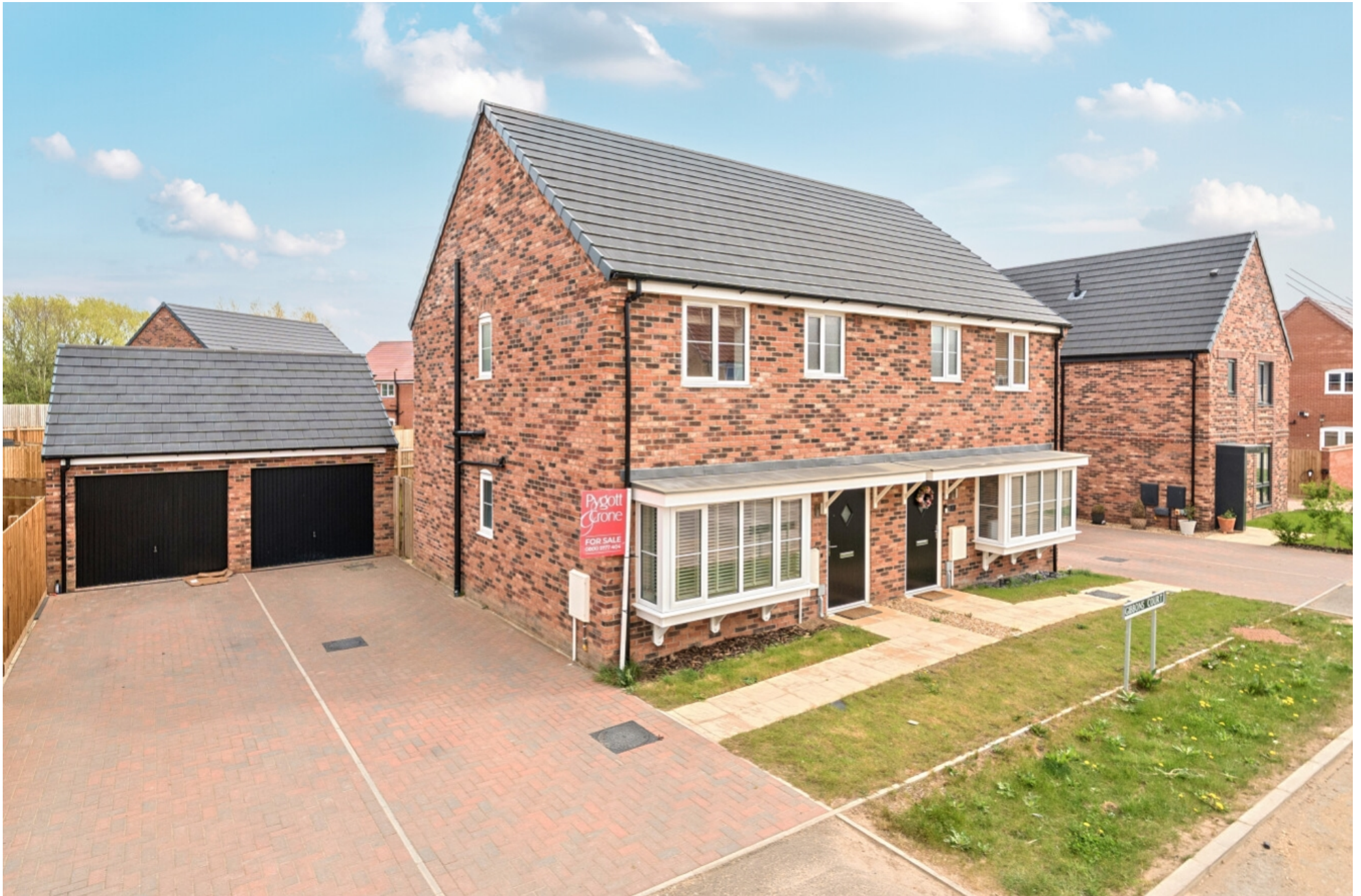
9 Gibbons Court, Holbeach, Spalding, Lincolnshire, PE12 7FP