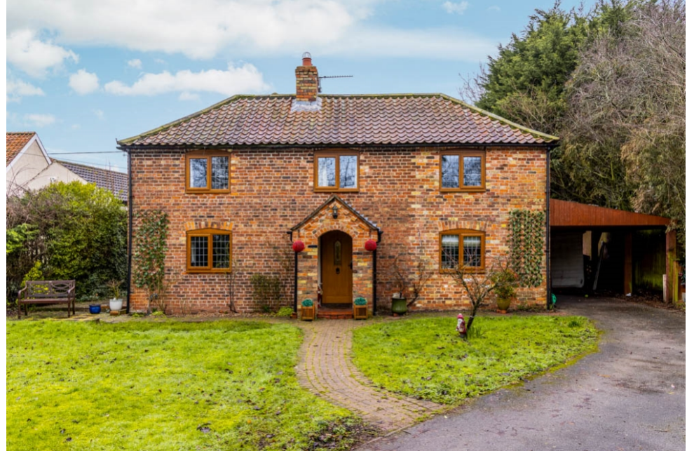
Red Rose Cottage, Willingham Road, East Barkwith, Market Rasen, Lincolnshire, LN8 5RP