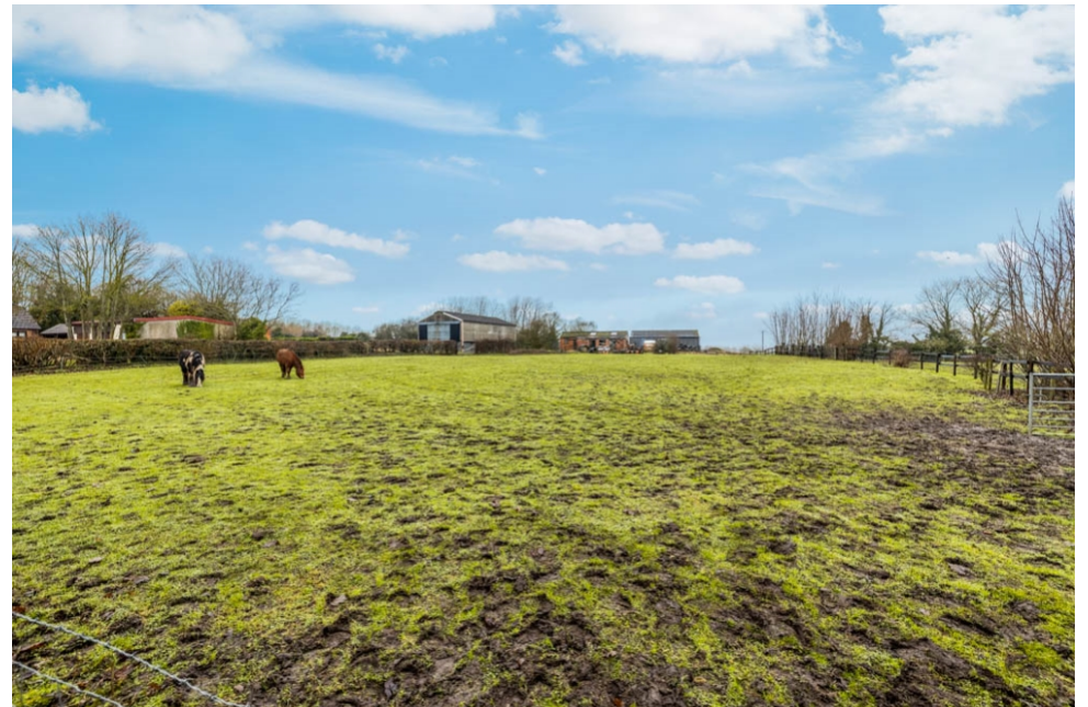
Red Rose Cottage, Willingham Road, East Barkwith, Market Rasen, Lincolnshire, LN8 5RP