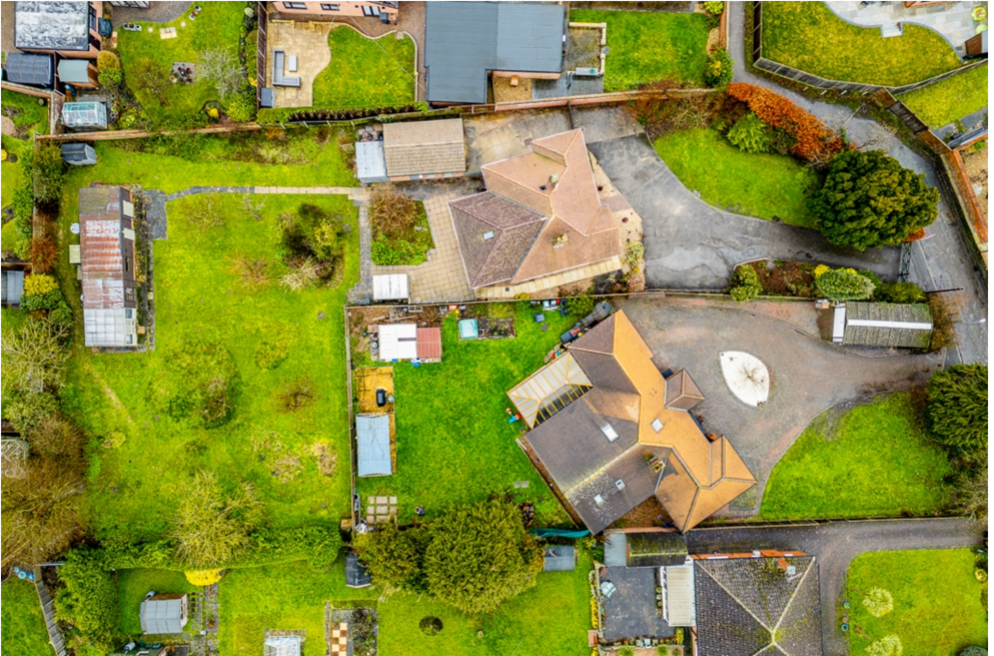
35 Water Lane, North Hykeham, Lincoln, Lincolnshire, LN6 9QT