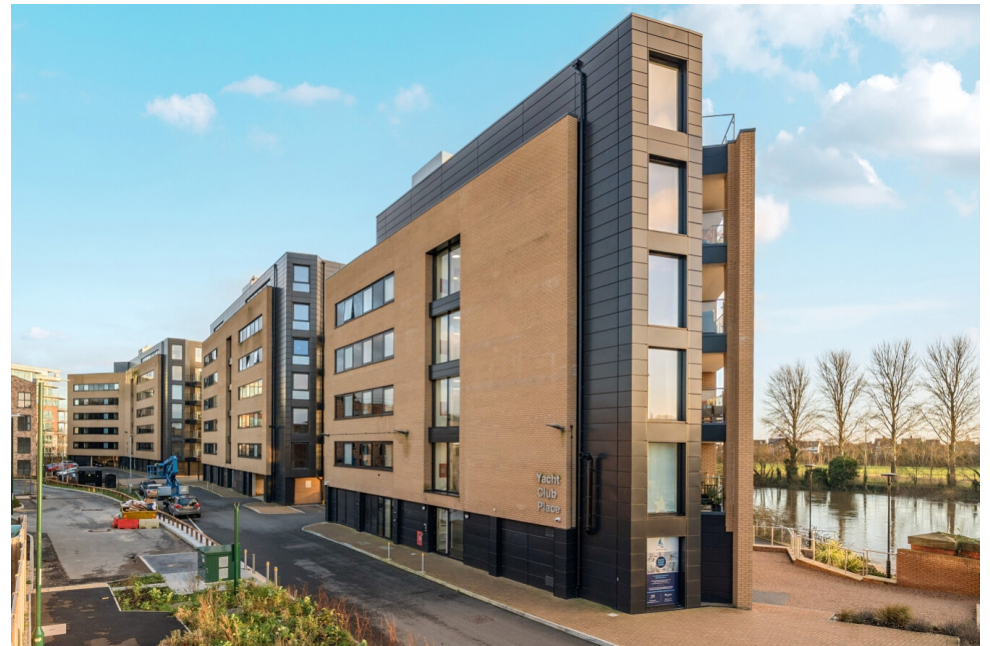
Apartment 16, Yacht Club Place, Trent Lane, Nottingham, Nottinghamshire, NG2 4RN