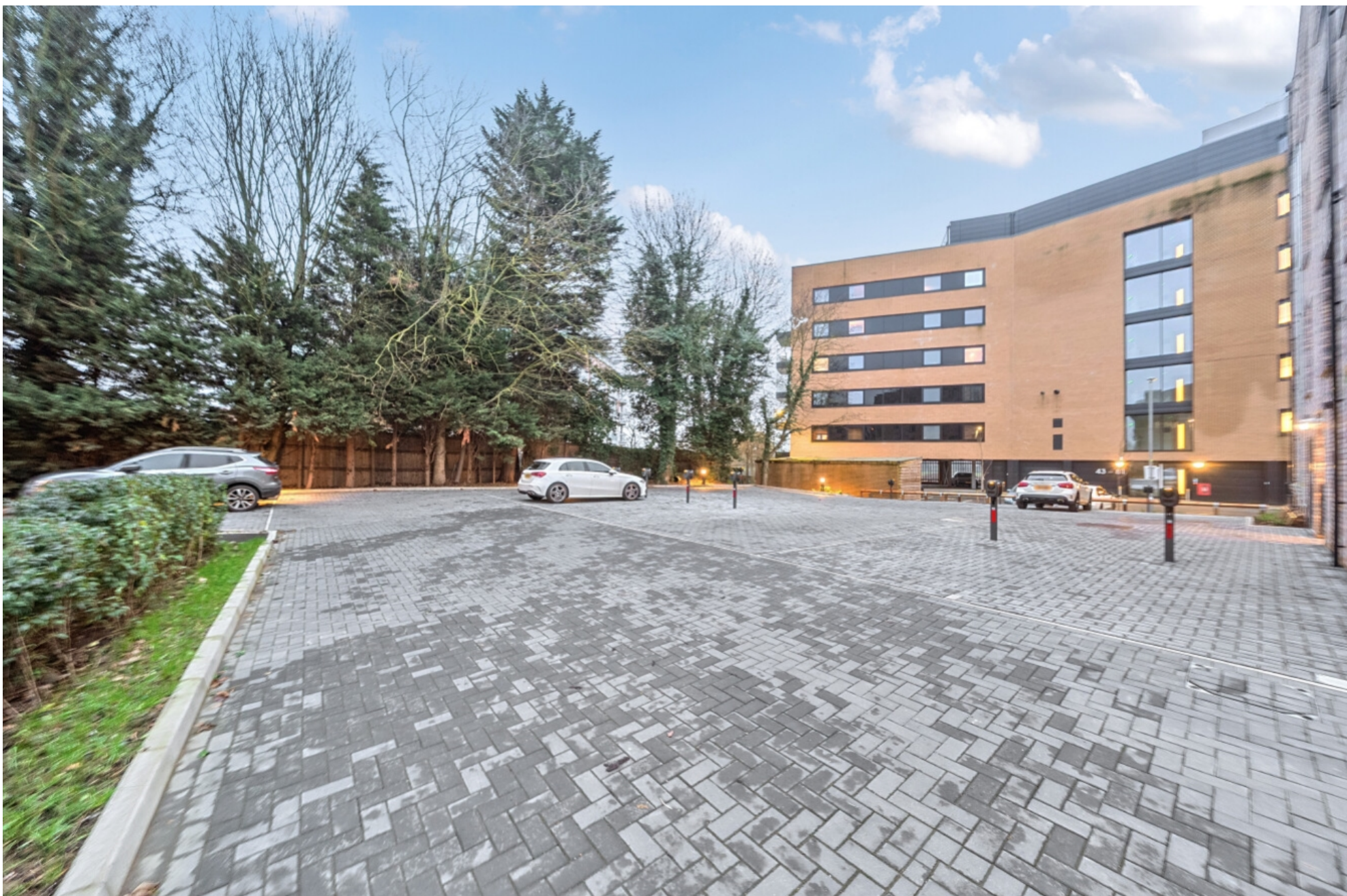
Apartment 14 Maythorn House, 1 Bridgewater Close, Nottingham, Nottinghamshire, NG2 4RR