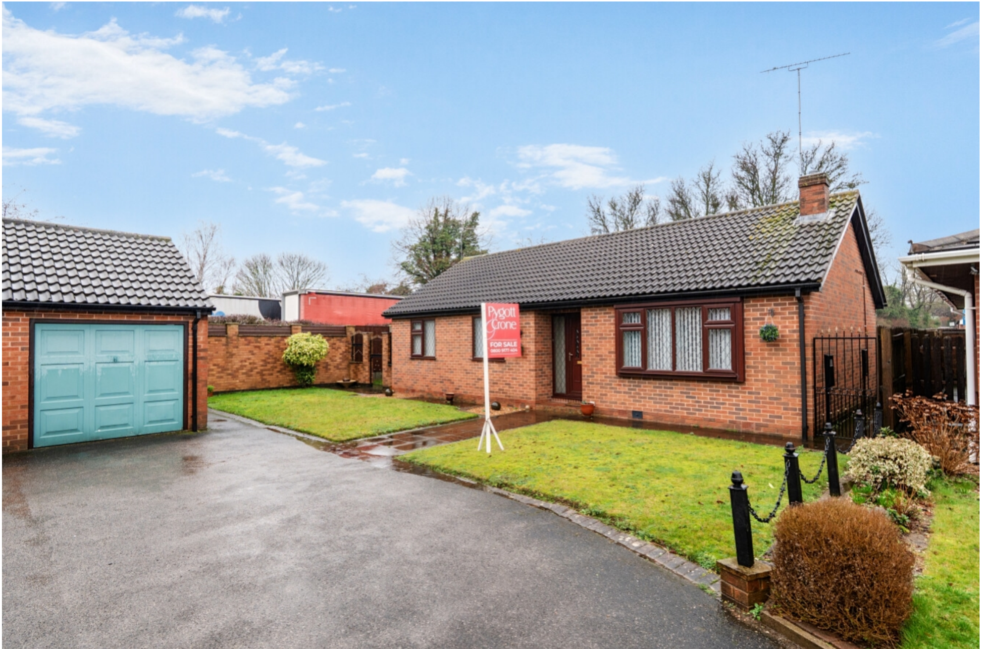
14 Colonsay Close, Trowell, Nottingham, Nottinghamshire, NG9 3RD