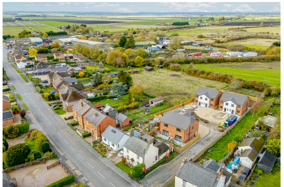
Plot 6, 6 Ted Hudson Way, Bardney, Lincoln, Lincolnshire, LN3 5UD