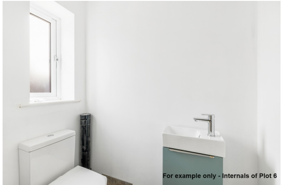
For example only - Internals of Plot 6