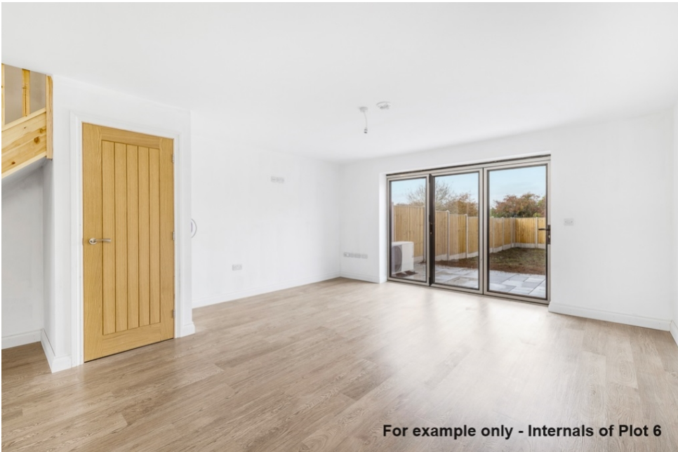
For example only - Internals of Plot 6