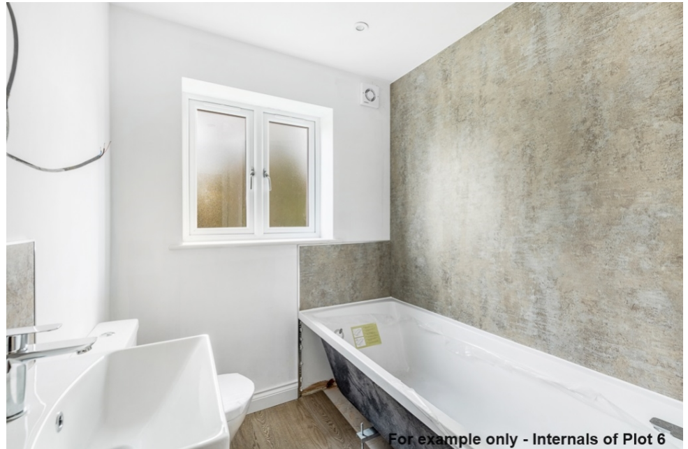
For example only - Internals of Plot 6