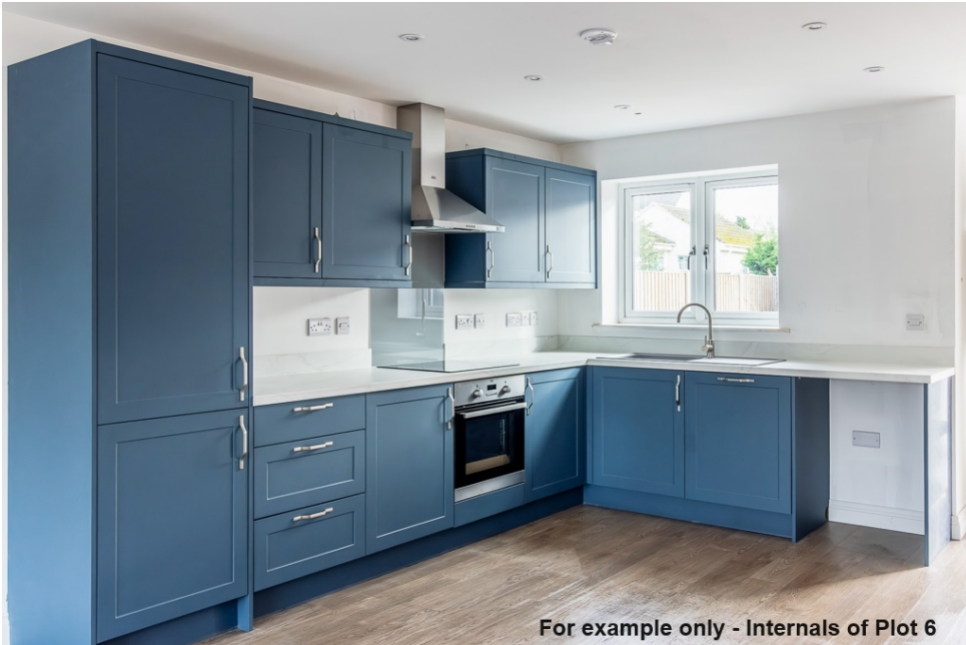
For example only - Internals of Plot 6