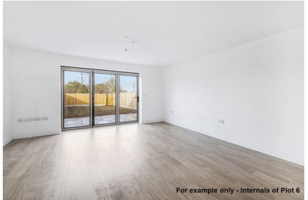
For example only - Internals of Plot 6