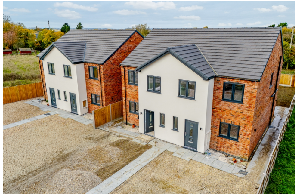
Plot 5, 5 Ted Hudson Way, Bardney, Lincoln, Lincolnshire, LN3 5UD