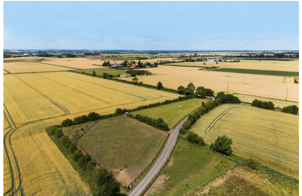
Poplar Farm, Crabtree Lane, Sutton-on-Sea, Mablethorpe, Lincolnshire, LN12 2RS