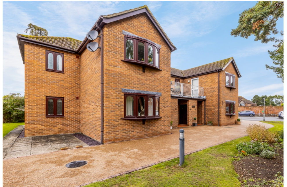
Flat 4, Elm Court, Sleaford Road, Boston, Lincolnshire, PE21 8EY