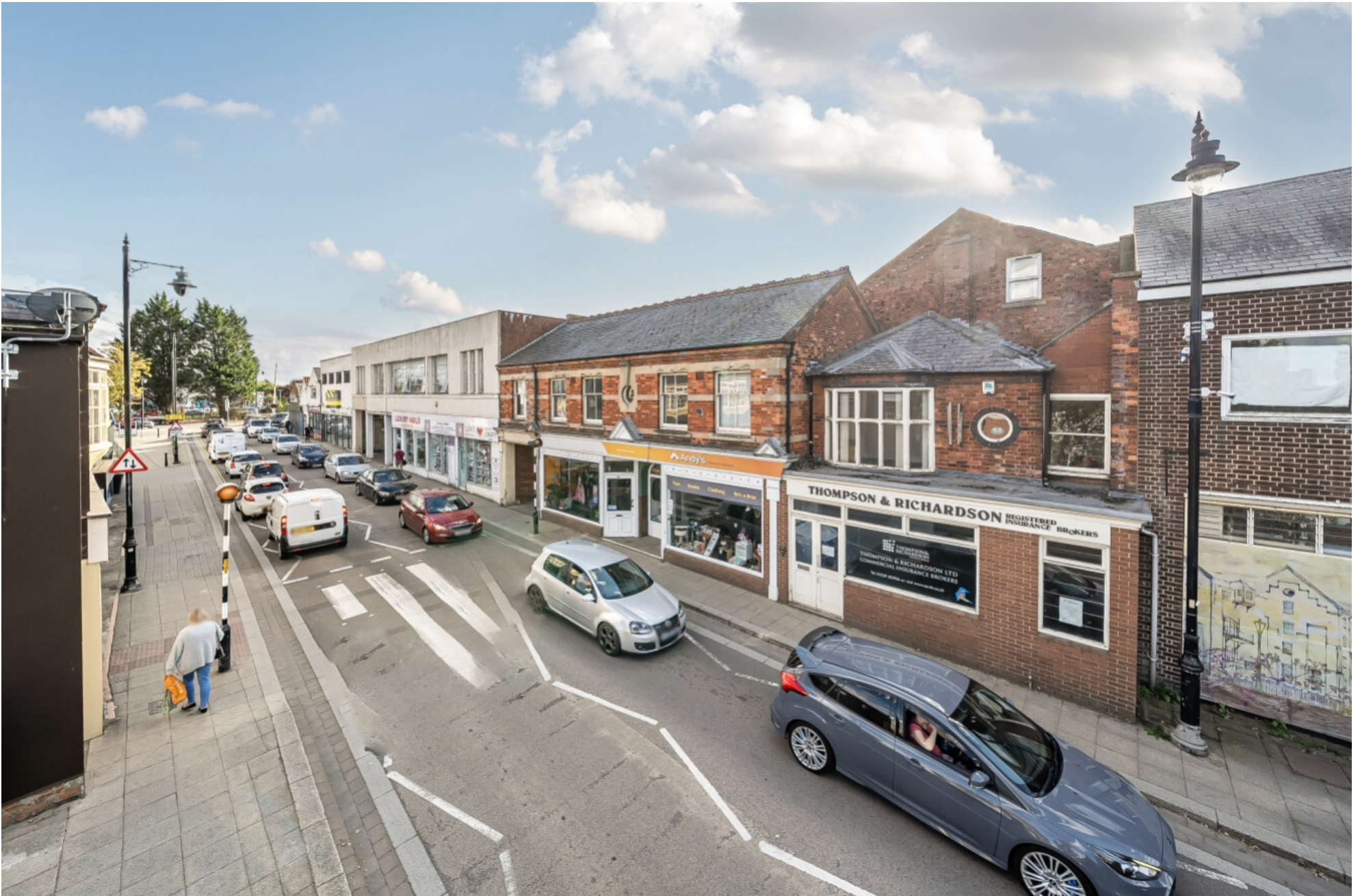
Monument House , 74-76, Southgate , Sleaford, Lincolnshire, NG34 7RL