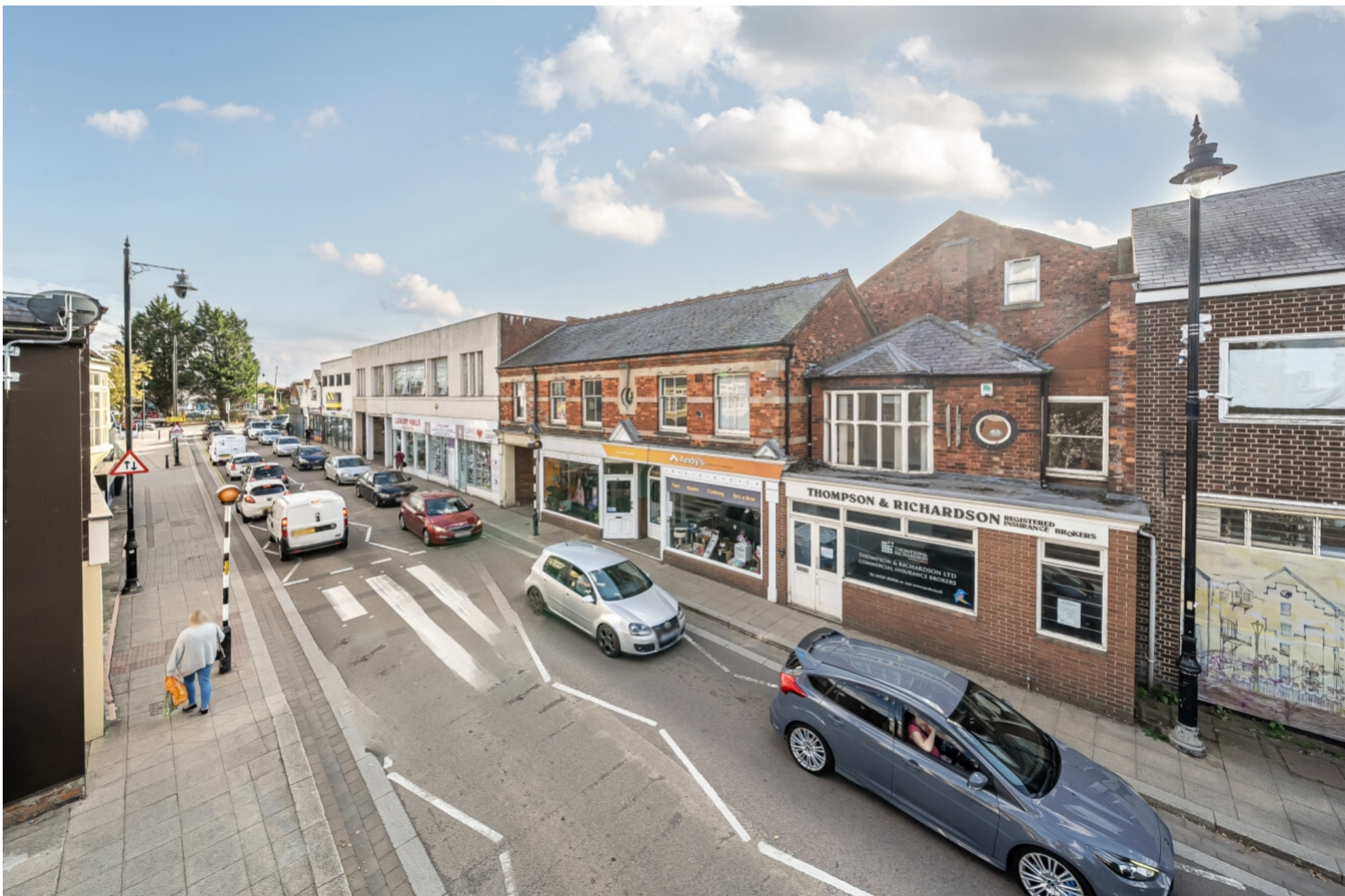
Monument House , 74-76, Southgate , Sleaford, Lincolnshire, NG34 7RL