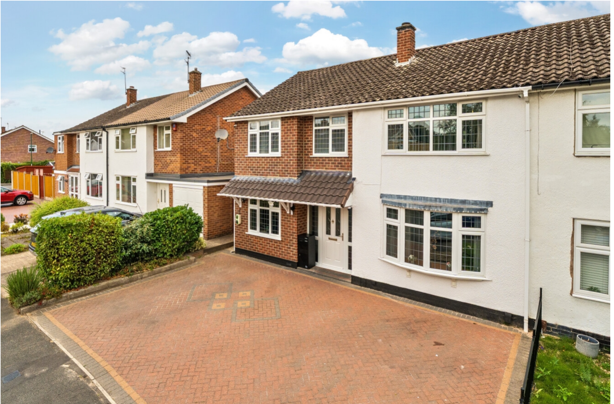
65 Ashchurch Drive, Wollaton, Nottinghamshire, NG8 2RB