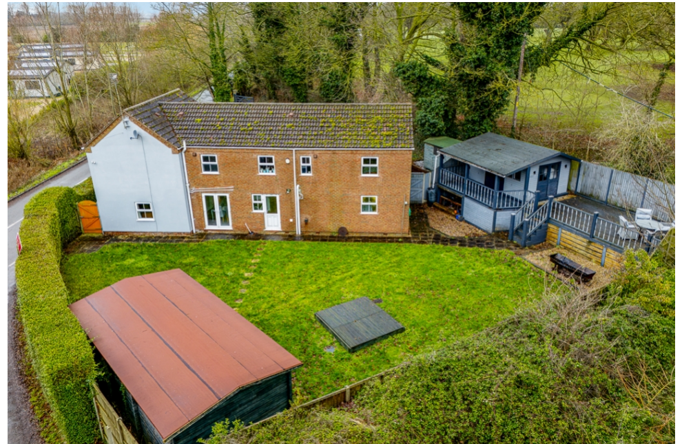
Hovenden Lodge, Fleet Bank, Holbeach, Spalding, Lincolnshire, PE12 8LW