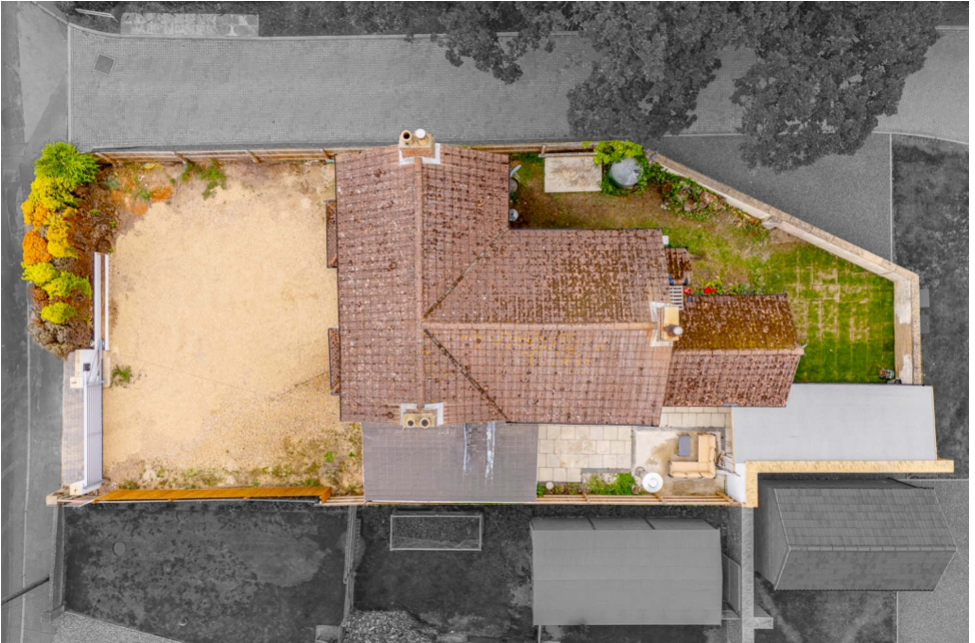
The Mulberries, Church Gate, Whaplode, Spalding, Lincolnshire, PE12 6TA