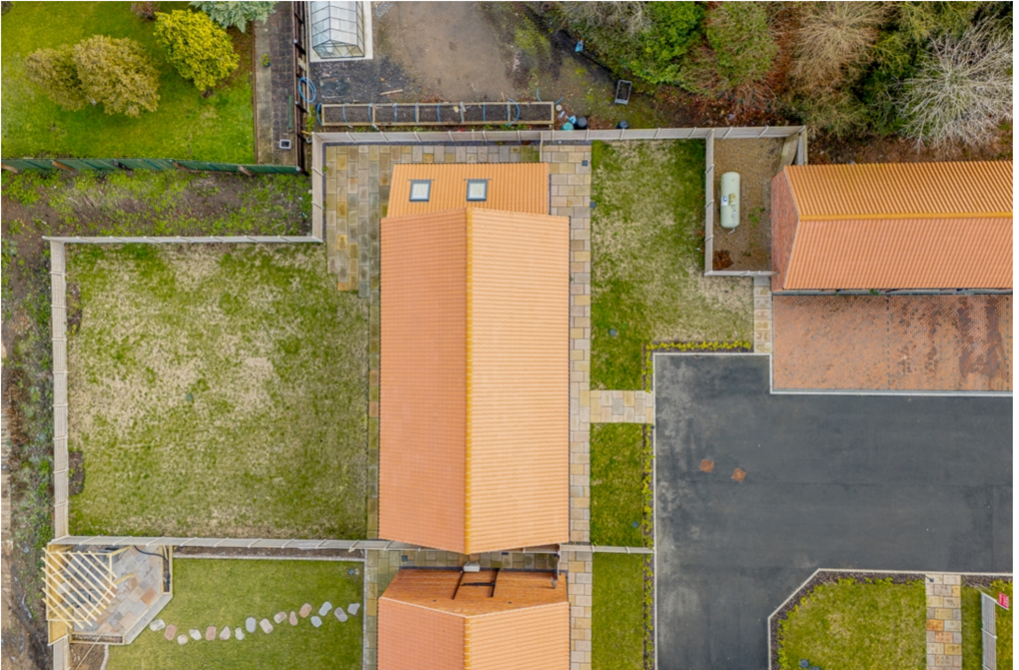
Plot 5, Windmill Grove, South Leverton, Retford, Nottinghamshire, DN22 0GD