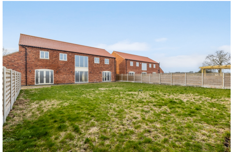
Plot 5, Windmill Grove, South Leverton, Retford, Nottinghamshire, DN22 0GD