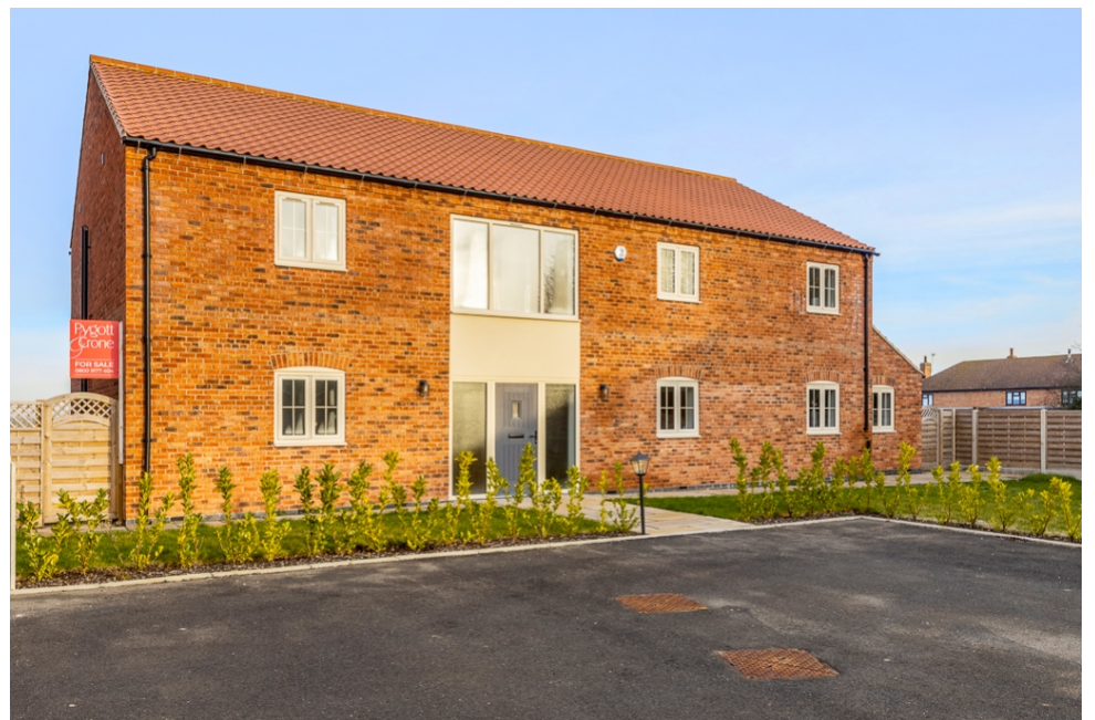
Plot 5, Windmill Grove, South Leverton, Retford, Nottinghamshire, DN22 0GD