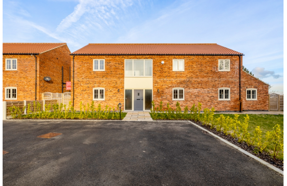
Plot 5, Windmill Grove, South Leverton, Retford, Nottinghamshire, DN22 0GD