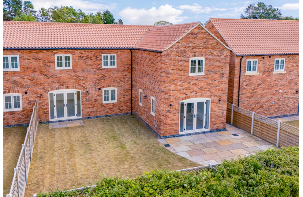
Plot 2, Windmill Grove, South Leverton, Retford, Nottinghamshire, DN22 0GD