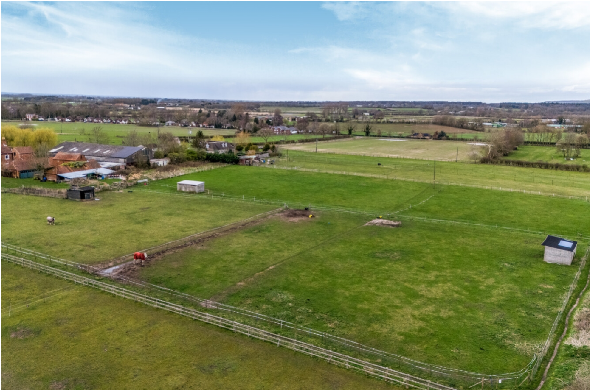
Croft Farm, South Lane, Middle Rasen, Market Rasen, Lincolnshire, LN8 3LG