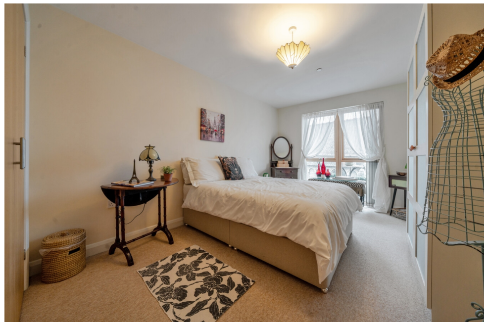
Apartment 4.2, Thorngate House, St. Swithins Square, Lincoln, Lincolnshire, LN21HA