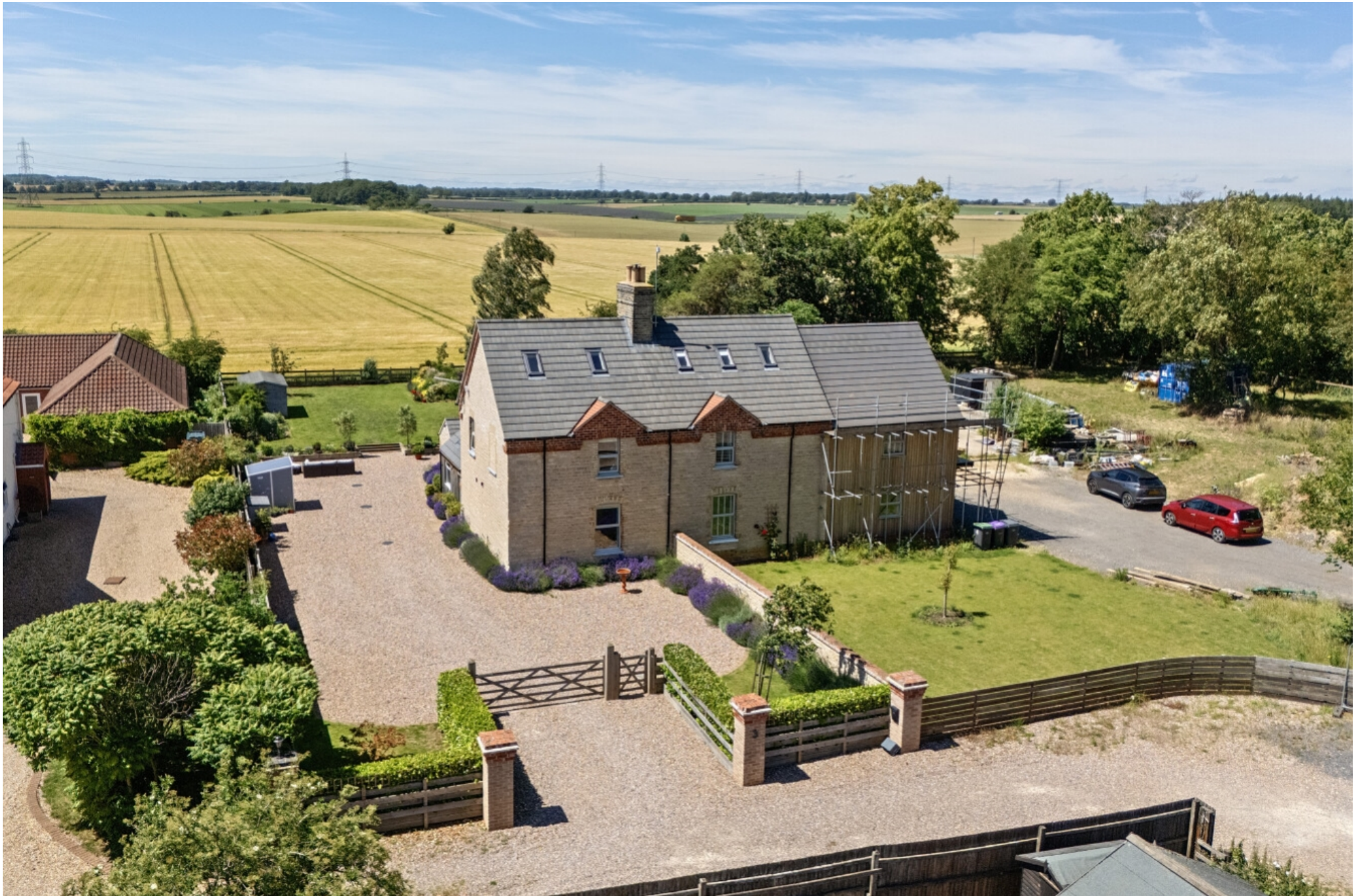
3 Slate House Cottages, Ashby De La Launde, Lincoln, Lincolnshire, LN4 3JL