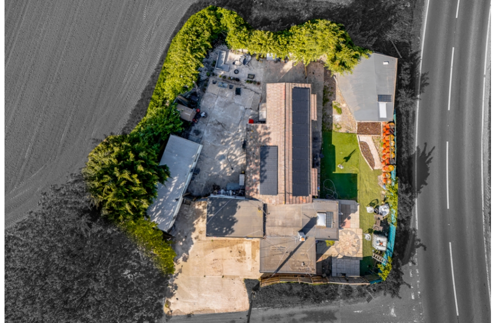
Rainbows End Bungalow, Greenfield Lane, Friskney, Boston, Lincolnshire, PE22 8QN