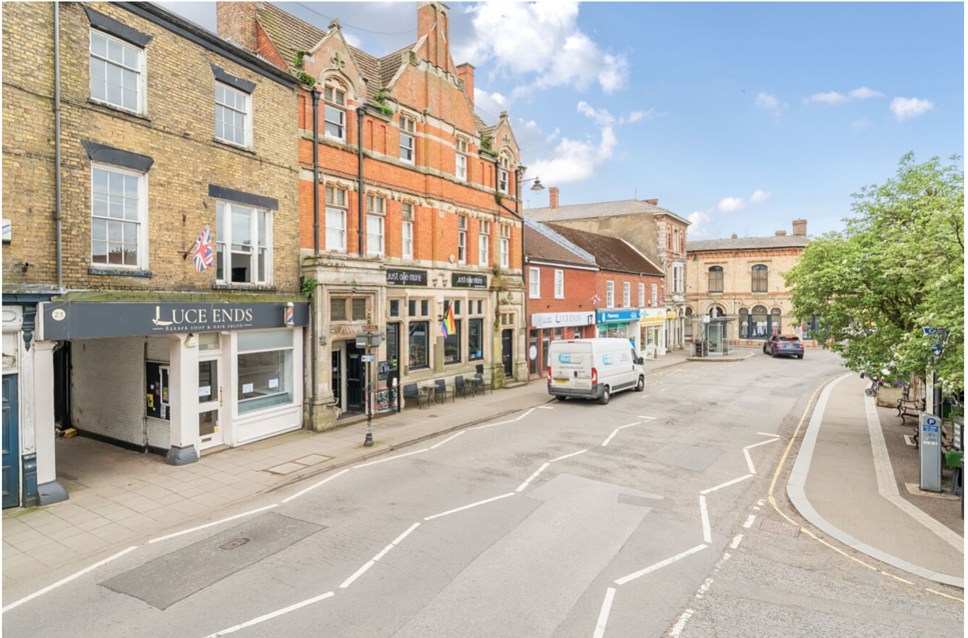
23 High Street, Horncastle, Lincolnshire, LN9 5HP