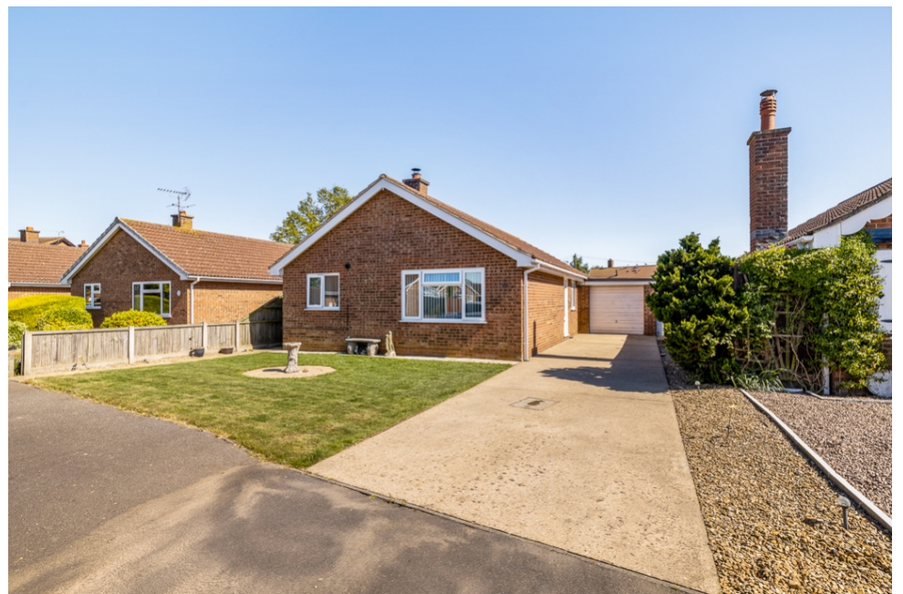
57 Prince William Drive, Butterwick, Boston, Lincolnshire, PE22 0JG