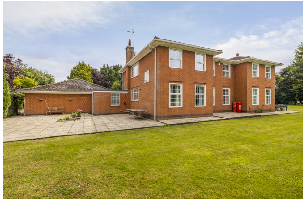
Wildmore Lodge, Langrick Road, New York, Lincoln, Lincolnshire, LN4 4XH