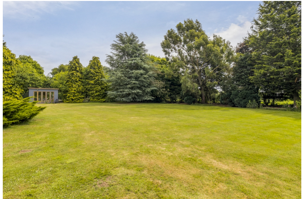
Wildmore Lodge, Langrick Road, New York, Lincoln, Lincolnshire, LN4 4XH