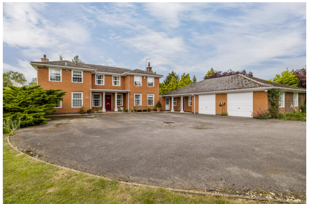
Wildmore Lodge, Langrick Road, New York, Lincoln, Lincolnshire, LN4 4XH